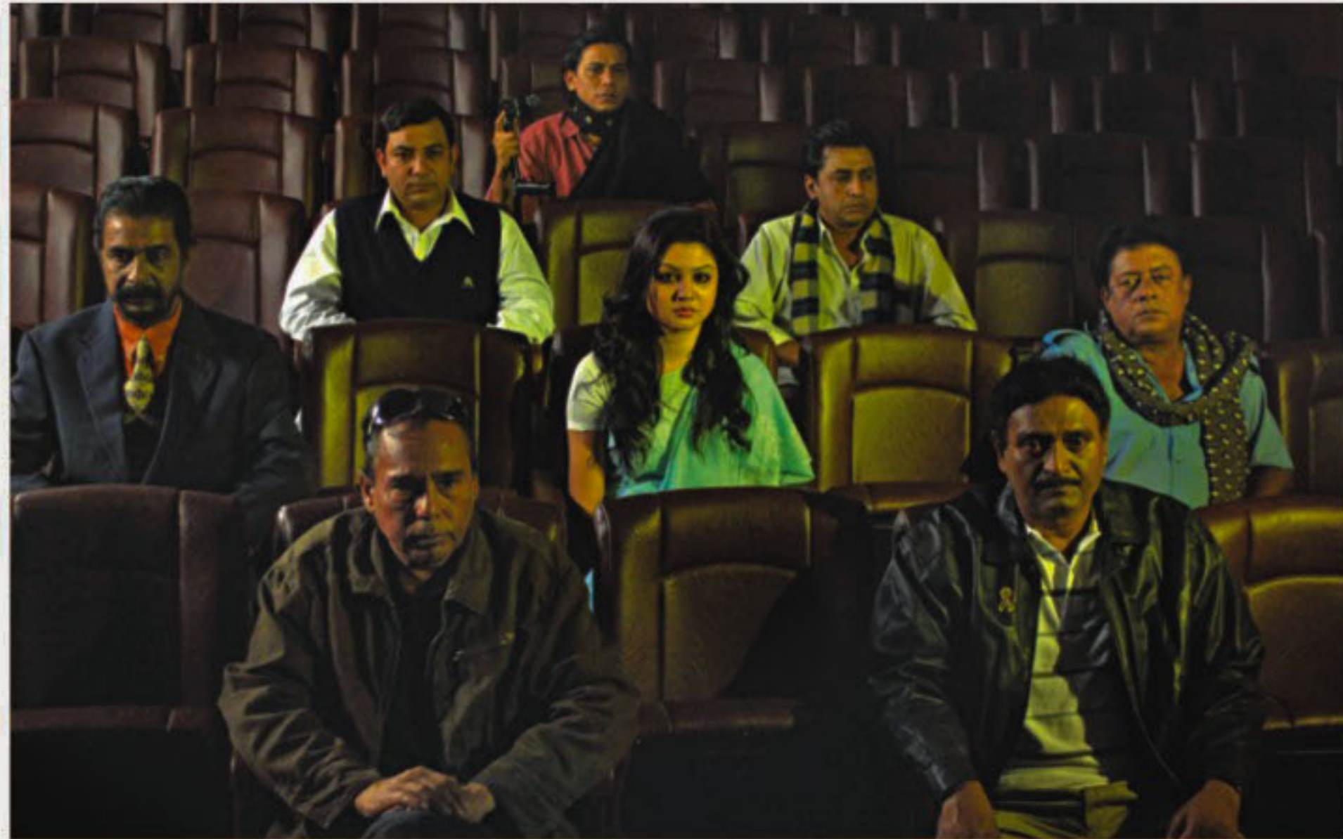
A scene from "Phirey Esho Behula".