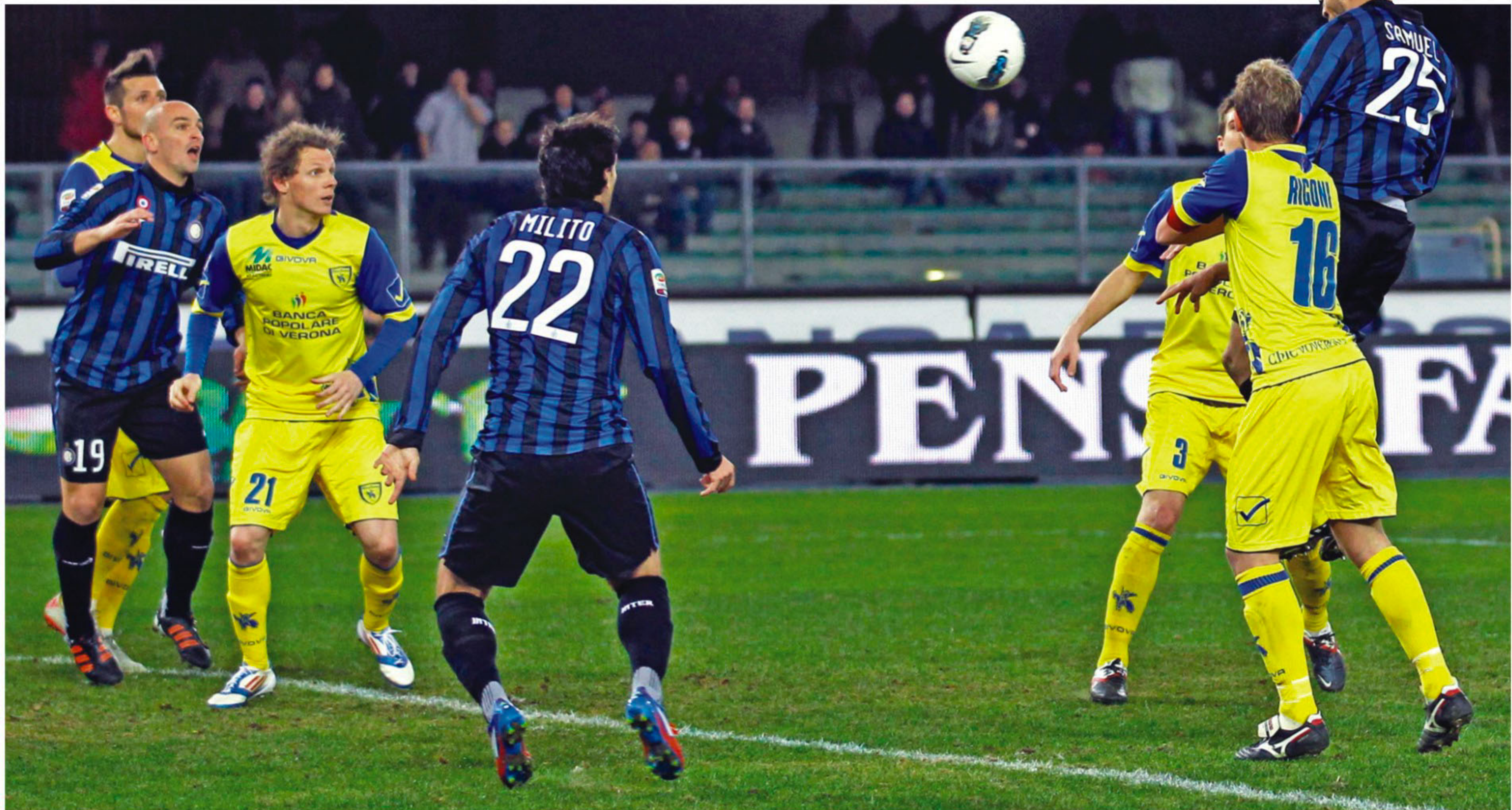
Inter Milan defender Walter Samuel (R) goes airborne to head in the opening goal during their Serie A encounter against Chievo in Verona on Friday.