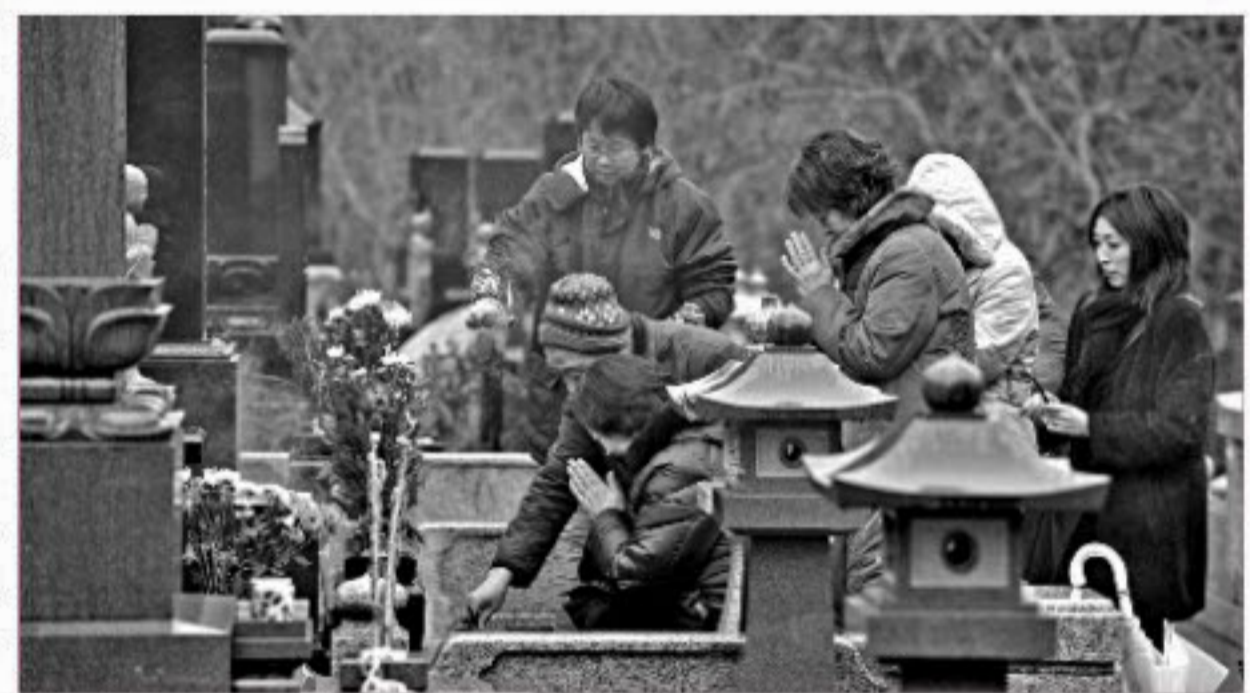
Relatives of the deceased pay tributes to their dear ones in Japan yesterday.

Rebuilding all that was lost will take time, but other things will take longer. In two towns in Miyagi prefecture, one of the worst-hit areas, 20% of residents report having chronic insomnia, and 5% report having a member of their household who is suicidal or having serious psychiatric