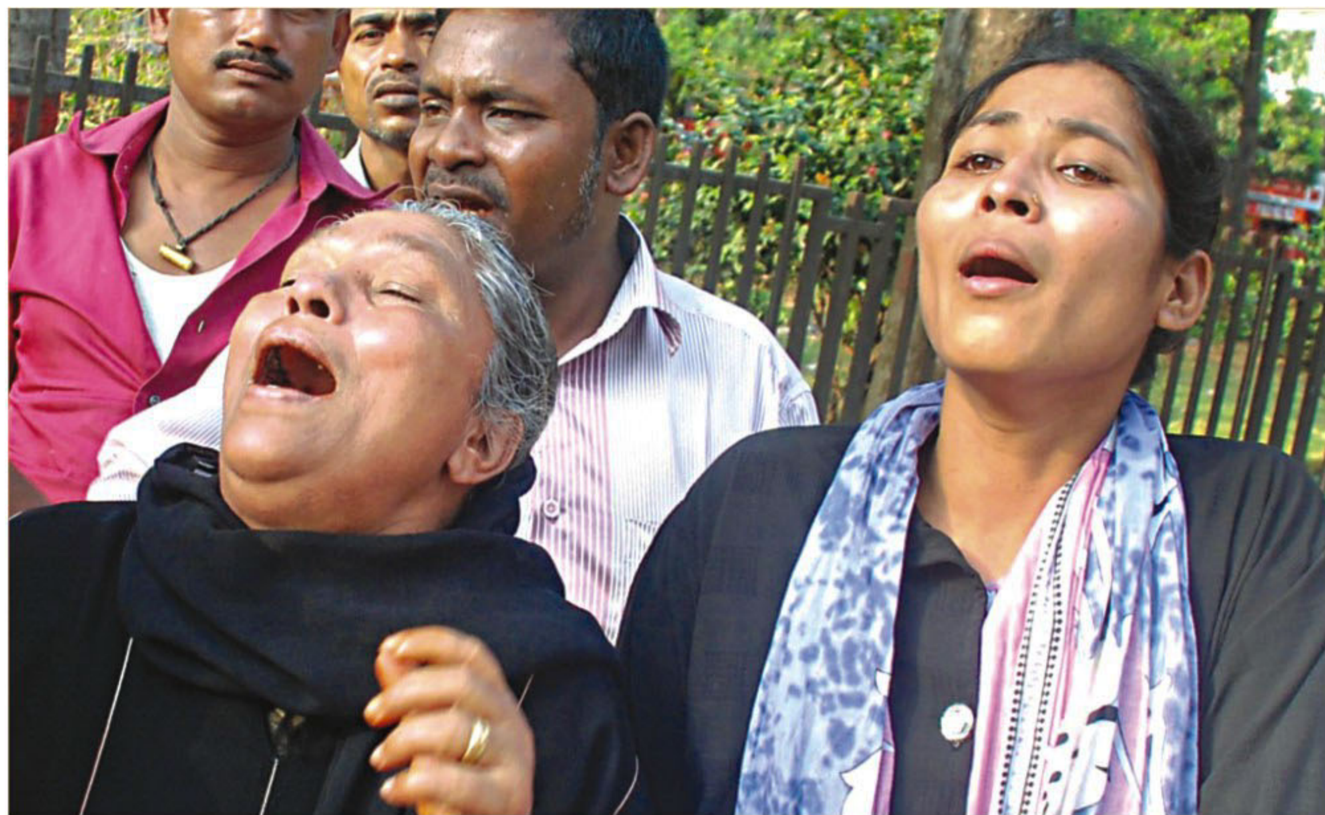
Mother and sister of a road accident victim wailing at the sight of their loved one's body at Chittagong Medical College Hospital. Five people were killed when a covered van rammed a three-wheeler at Sitakunda in Chittagong yesterday.