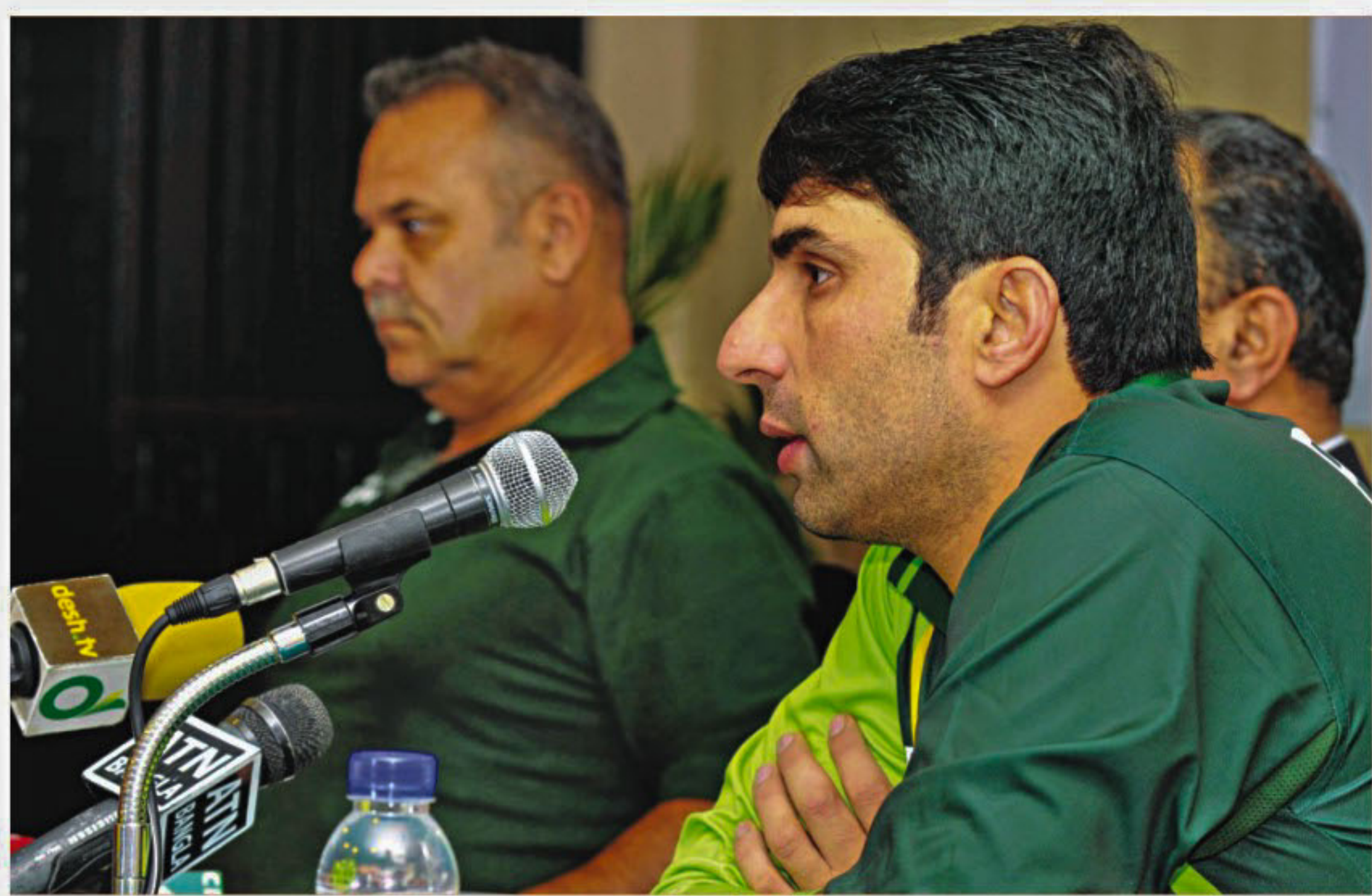
Pakistan cricket captain Misbahul Haq, right, speaks to reporters during a media conference at Hotel Sonargaon yesterday. On the left is Pakistan's new coach Dav Whatmore. Story on Page 16.