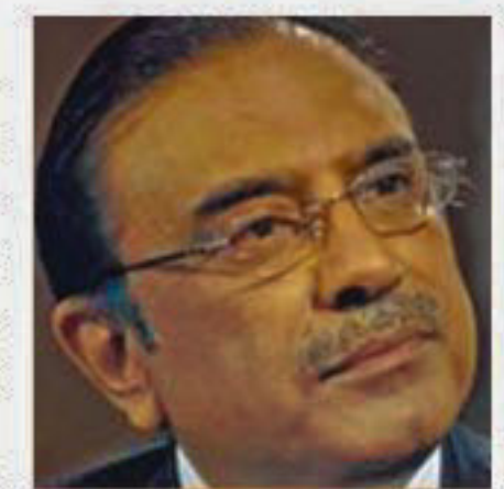
Asif Ali Zardari

Orders Pak Supreme Court BBC ONLINE Pakistan's Supreme Court yesterday ordered the government to request the Swiss authorities to reopen a corruption case against President Asif Ali Zardari. The case is at the centre of contempt proceedings against Prime Minister Yousuf Raza Gilani, who is accused of failing to pursue the allegations. The government has argued that Zardari has presidential immunity. He says the case is politically motivated. But the court has said a compliance report must be filed by 21 March. The Supreme Court earlier adjourned a contempt hearing against the prime minister to 21 March as well, saying that Gilani must either file a statement or testify personally SEE PAGE 19 COL 1