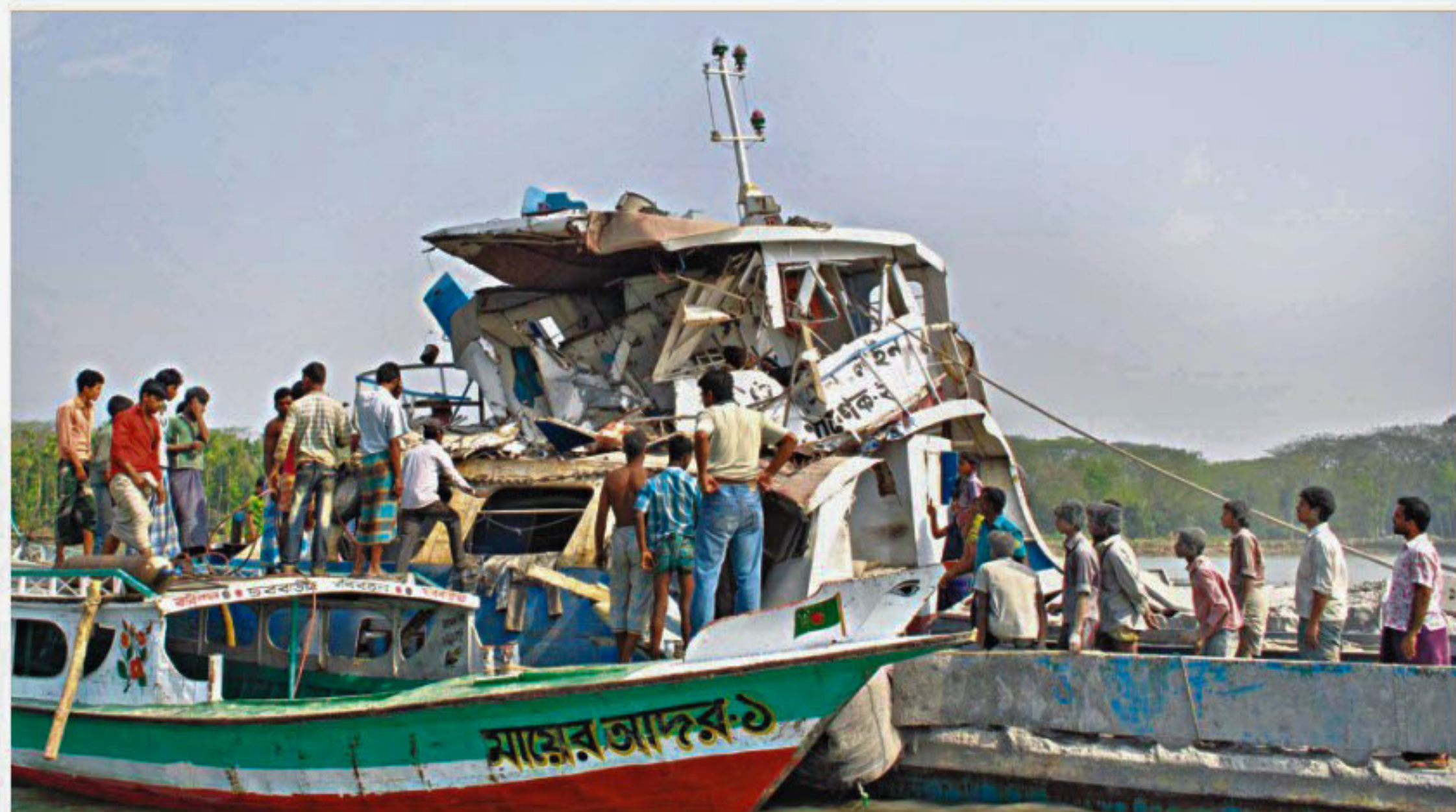
The destroyed bridge of the cargo vessel after it collided with a launch on the Kirtonkhola river in Barisal yesterday.

PLEASE CAST YOUR VOTE AT www.thedailystar.net YOU MAY ALSO VOTE AT facebook.com/dailystarnews