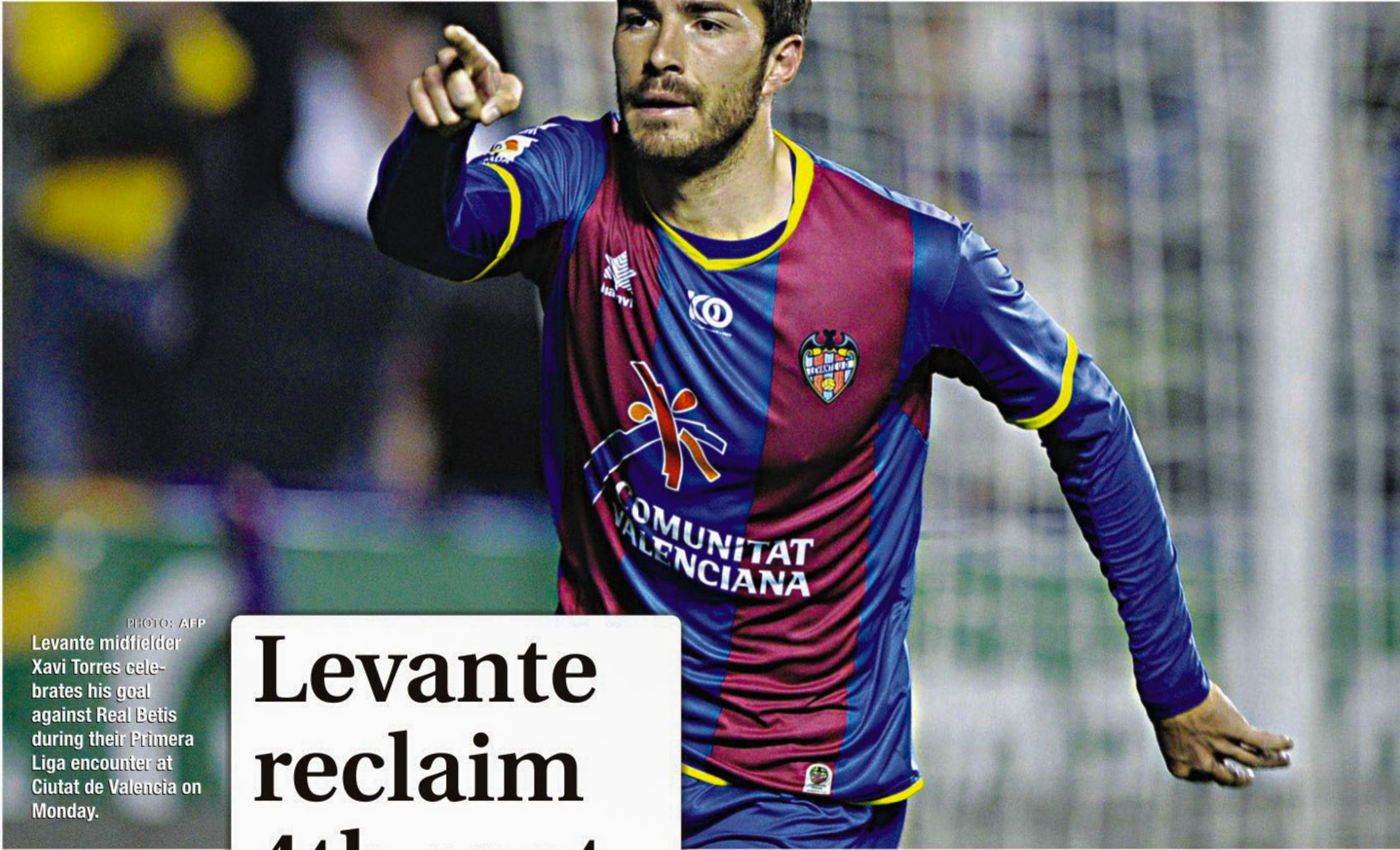
Levante midfielder Xavi Torres celebrates his goal against Real Betis during their Primera Liga encounter at Ciutat de Valencia on Monday.

Redknapp thinks Mourinho, who won five trophies during a three-year spell at Chelsea, could return to Stamford Bridge, although luring the 49-year-old from his current employers Real Madrid may be difficult.