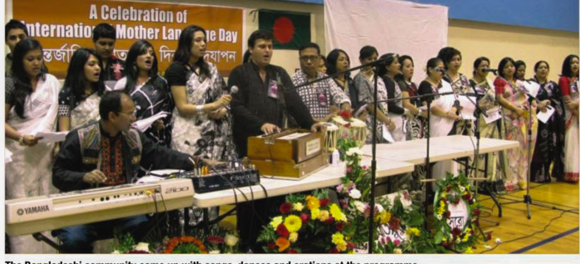
The Bangladeshi community came up with songs, dances and orations at the programme.

THE WRITER IS A CULTURAL ACTIVIST AND DOCUMENTARY FILMMAKER.