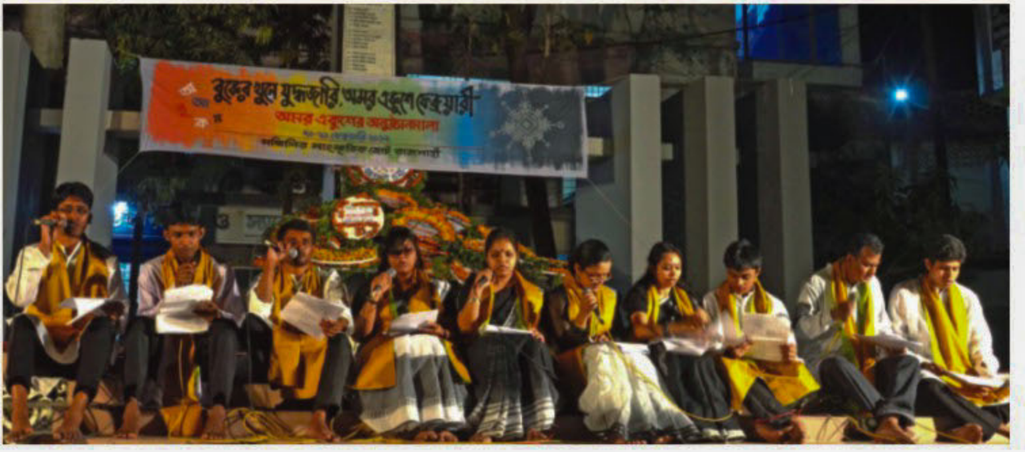
Dance Academy performed on the concluding day.

Hindol Shangkritik Gosthi, Joy Bangla Shankgkritik Jote, Shangeet Shikha Bhaban, Shree Shangeetaloy, Spondon Nriyalyoy, Rajshahi Abrtti Kendra and Nriyakothea