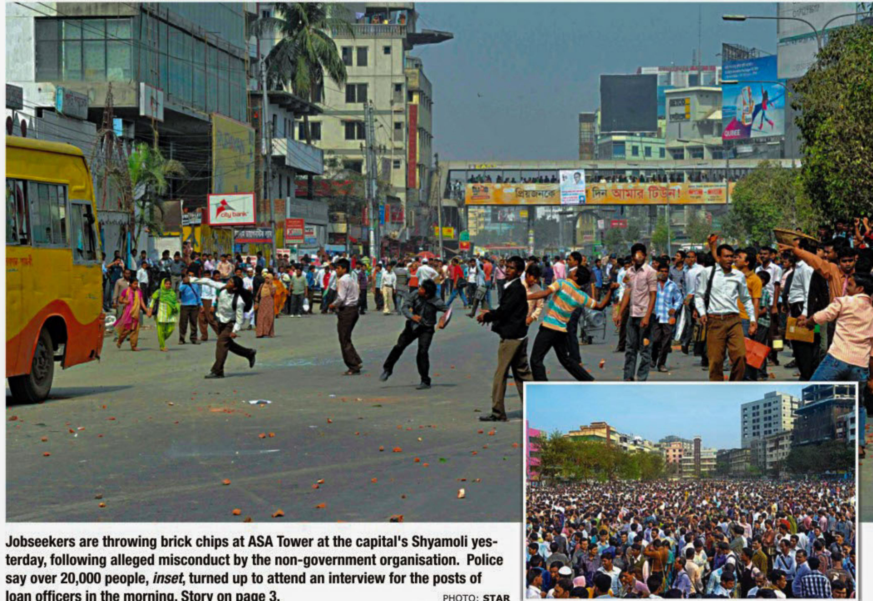
Jobseekers are throwing brick chips at ASA Tower at the capital's Shyamoli yesterday, following alleged misconduct by the non-government organisation. Police say over 20,000 people, inset , turned up to attend an interview for the posts of loan officers in the morning. Story on page 3.