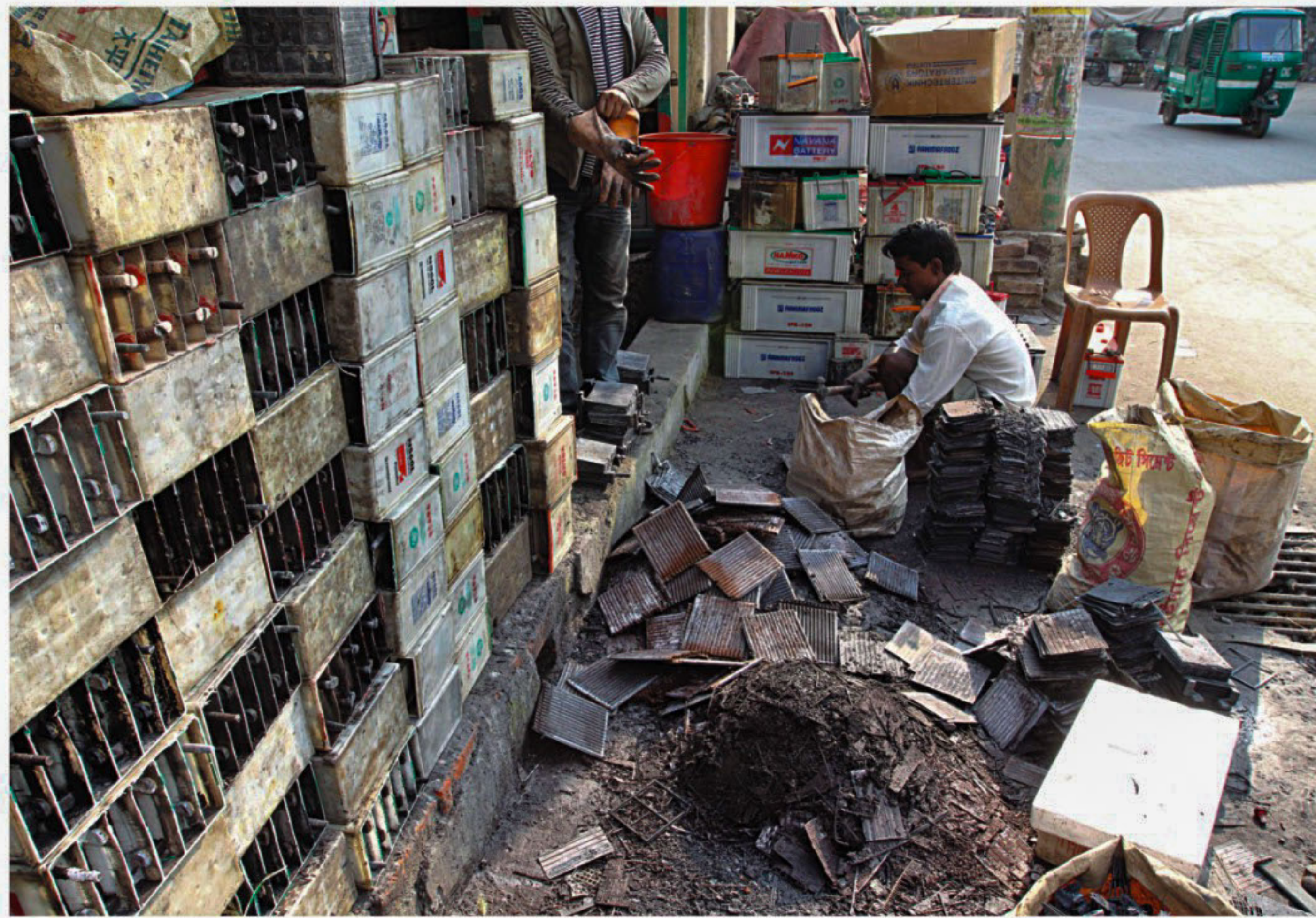
A worker is breaking used batteries in the open to get reusable parts out of them. The act poses health risks for people as the broken batteries release carbon particles and toxic chemicals into the environment. The photo was shot at the city's Kakrail a few days ago.