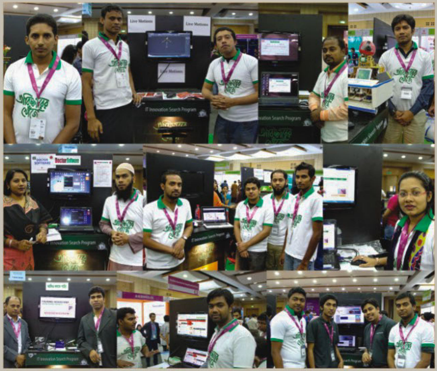
IT Innovators at SoftExpo