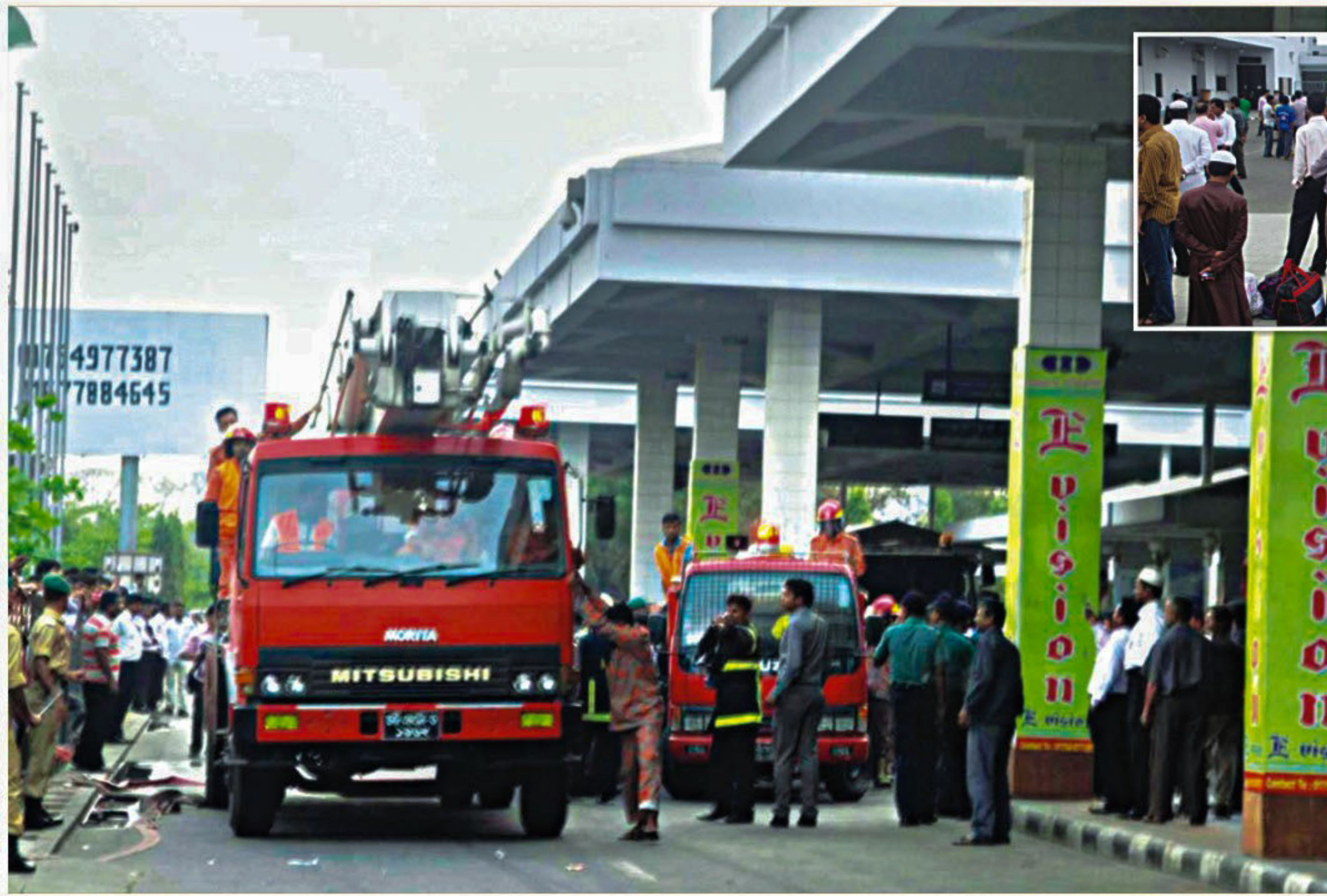
A fire engine arrives while passengers run out as a fire breaks out at Shah Amanat Airport in Chittagong yesterday.