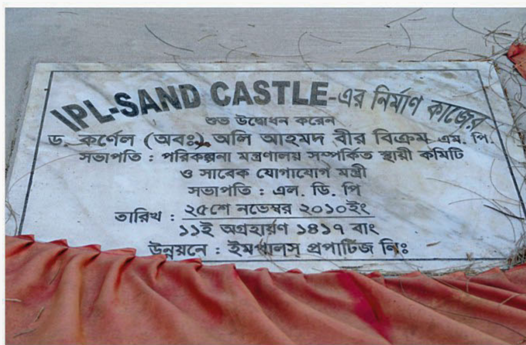
The photo on the left shows the foundation stone laid in 2010 by Col (retd) Oli Ahmad himself for a construction work (photo on the right taken recently) on Cox's Bazar beach. The site falls in an ecologically critical area where any type of construction is prohibited.

CORRECTION A report published on Wednesday under the headline, 'Saline death' for half the country, the budget of Indian river-linking project was mentioned as Rs 5,000 crore. In fact, the amount is Rs 5,00,000 crore. We regret the error.