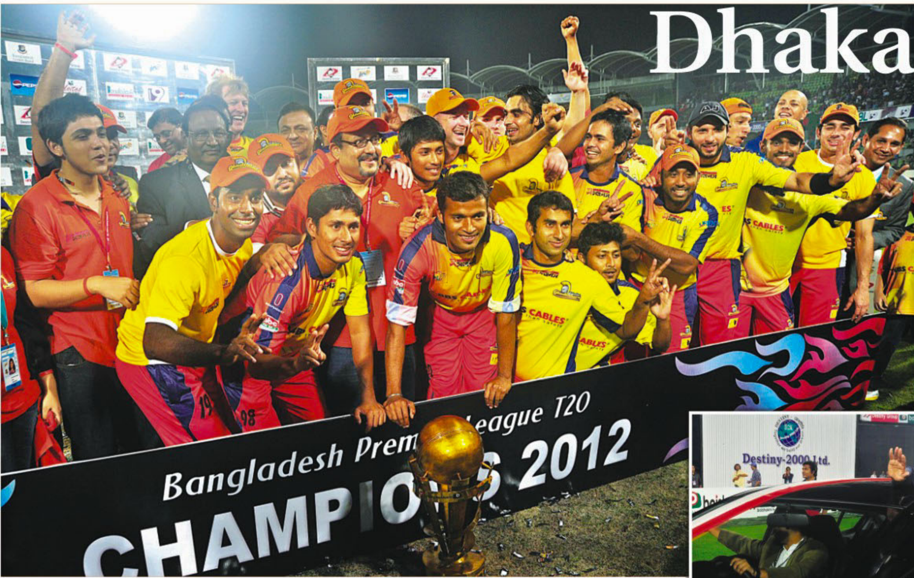
Players and officials of Dhaka Gladiators celebrate with the Bangladesh Premier League trophy after defeating Barisal Burners in the final at the Sher-e-Bangla National Stadium in Mirpur last night. (Inset) Man-of-the-tournament Shakib Al Hasan of Khulna Royal Bengals embarks on a joyride on his Honda City car.