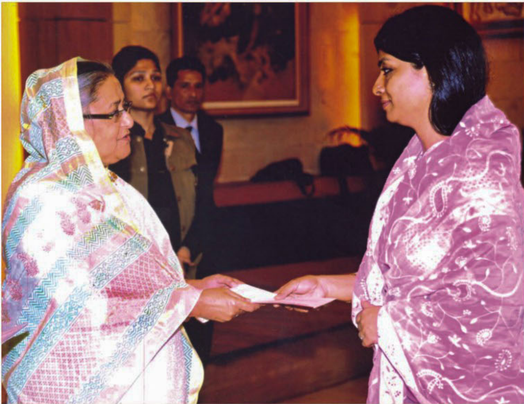
Prime Minister Sheikh Hasina distributes checks among families, victimised by the 2009 BDR mutiny, at her official residence of Gono Bhaban yesterday.