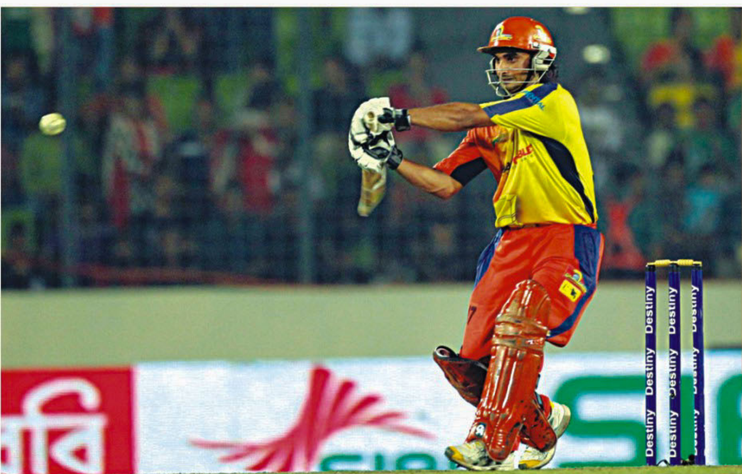
Dhaka Gladiators' Pakistani opener Imran Nazir pulls on his way to a swashbuckling 75 in the final of the Bangladesh Premier League (BPL) match against Barisal Burners at the Sher-e-Bangla National Stadium in Mirpur yesterday. Nazir's heroics propelled Dhaka to a 8-wicket victory. Story on Page 16.