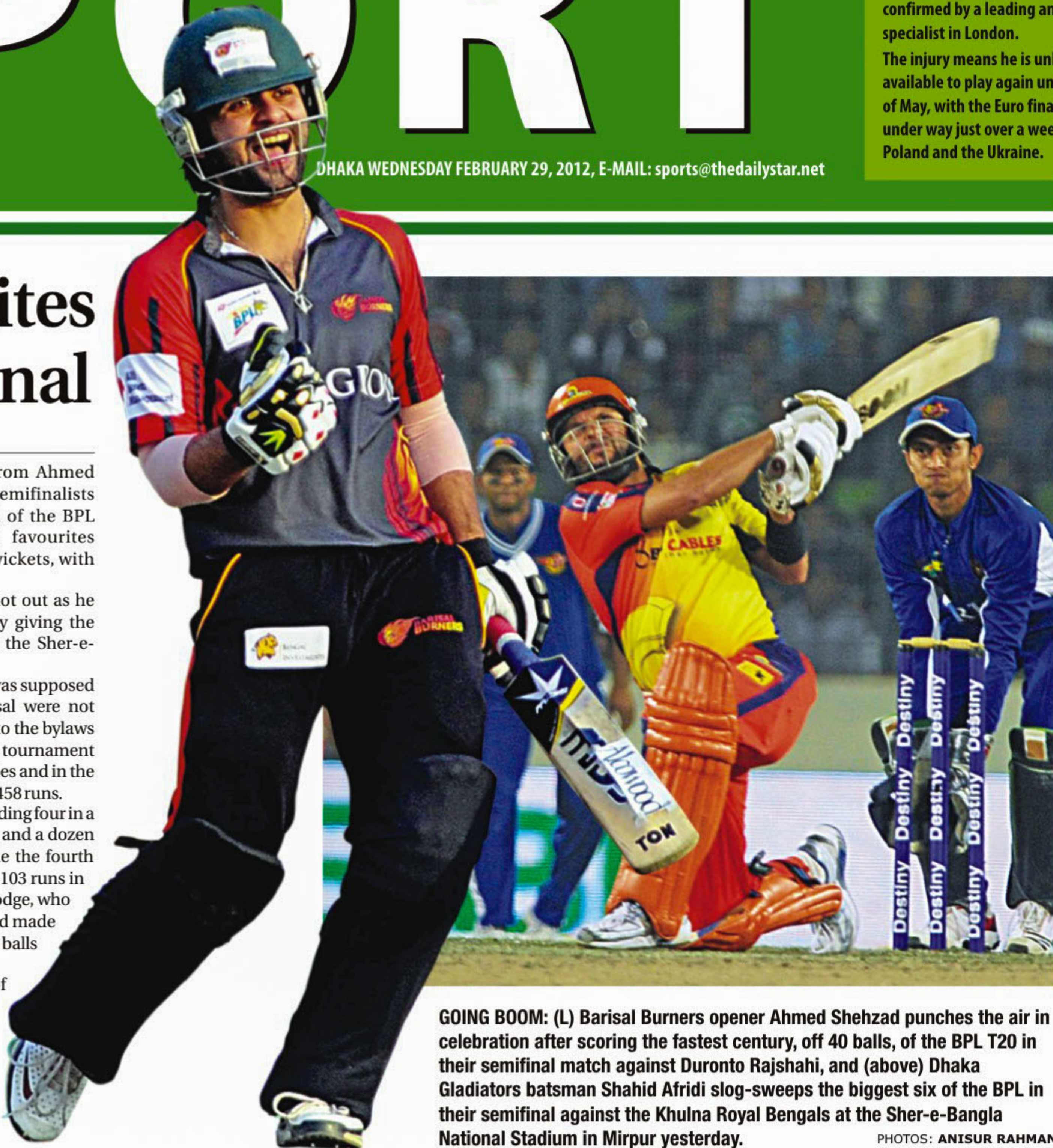
GOING BOOM: (L) Barisal Burners opener Ahmed Shehzad punches the air in celebration after scoring the fastest century, off 40 balls, of the BPL T20 in their semifinal match against Duronto Rajshahi, and (above) Dhaka Gladiators batsman Shahid Afridi slog-sweeps the biggest six of the BPL in their semifinal against the Khulna Royal Bengals at the Sher-e-Bangla National Stadium in Mirpur yesterday.