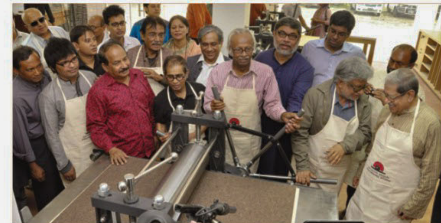
Veteran artists, participating printmakers and organisers at the inaugural ceremony.