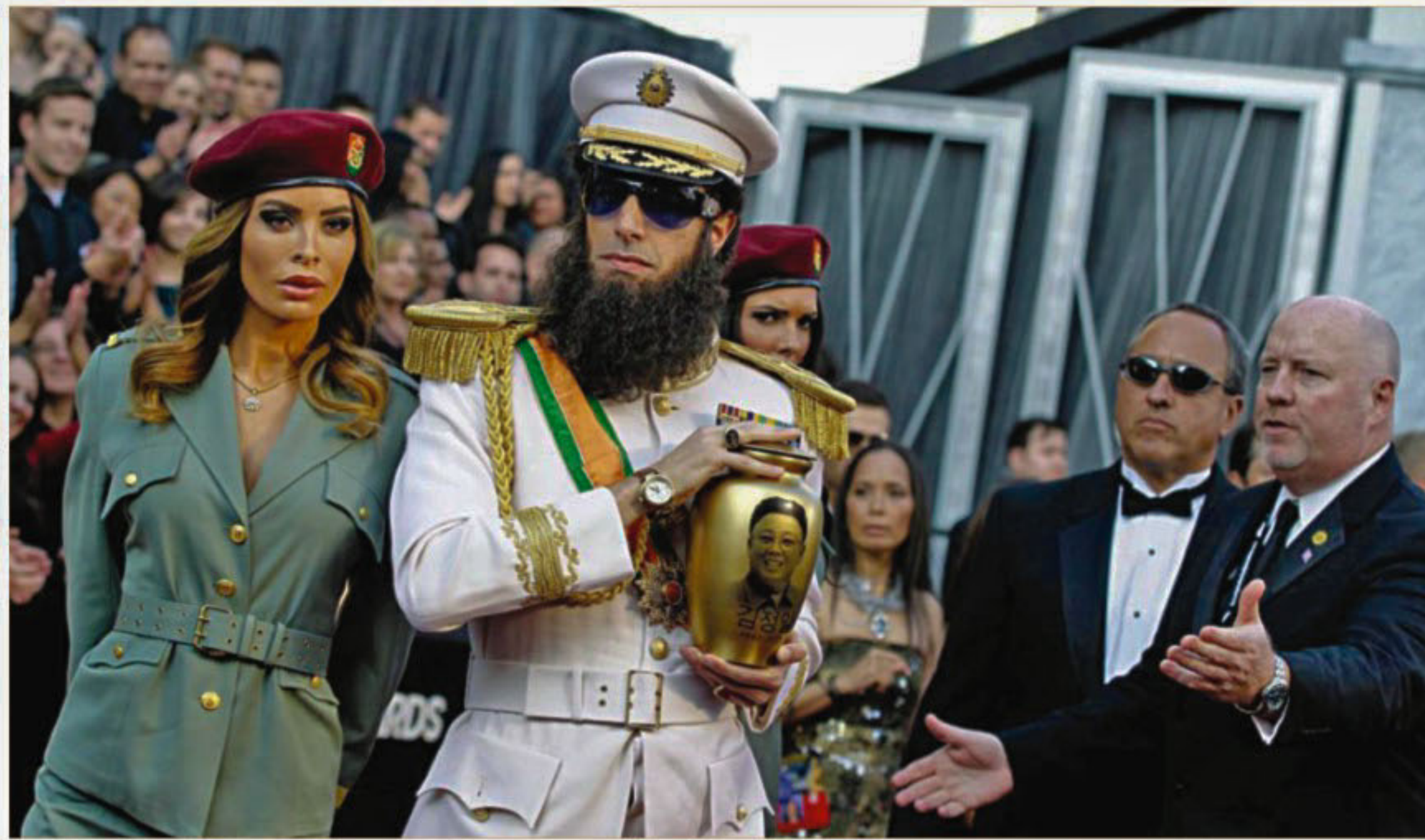
Sacha Baron Cohen, centre, arrives before the 84th Academy Awards on Sunday.