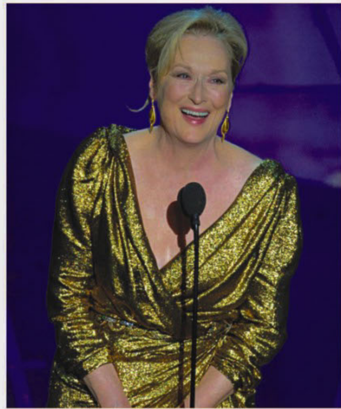
Meryl Streep accepts the Oscar for best actress in a leading role for 'The Iron Lady' during the 84th Academy Awards.