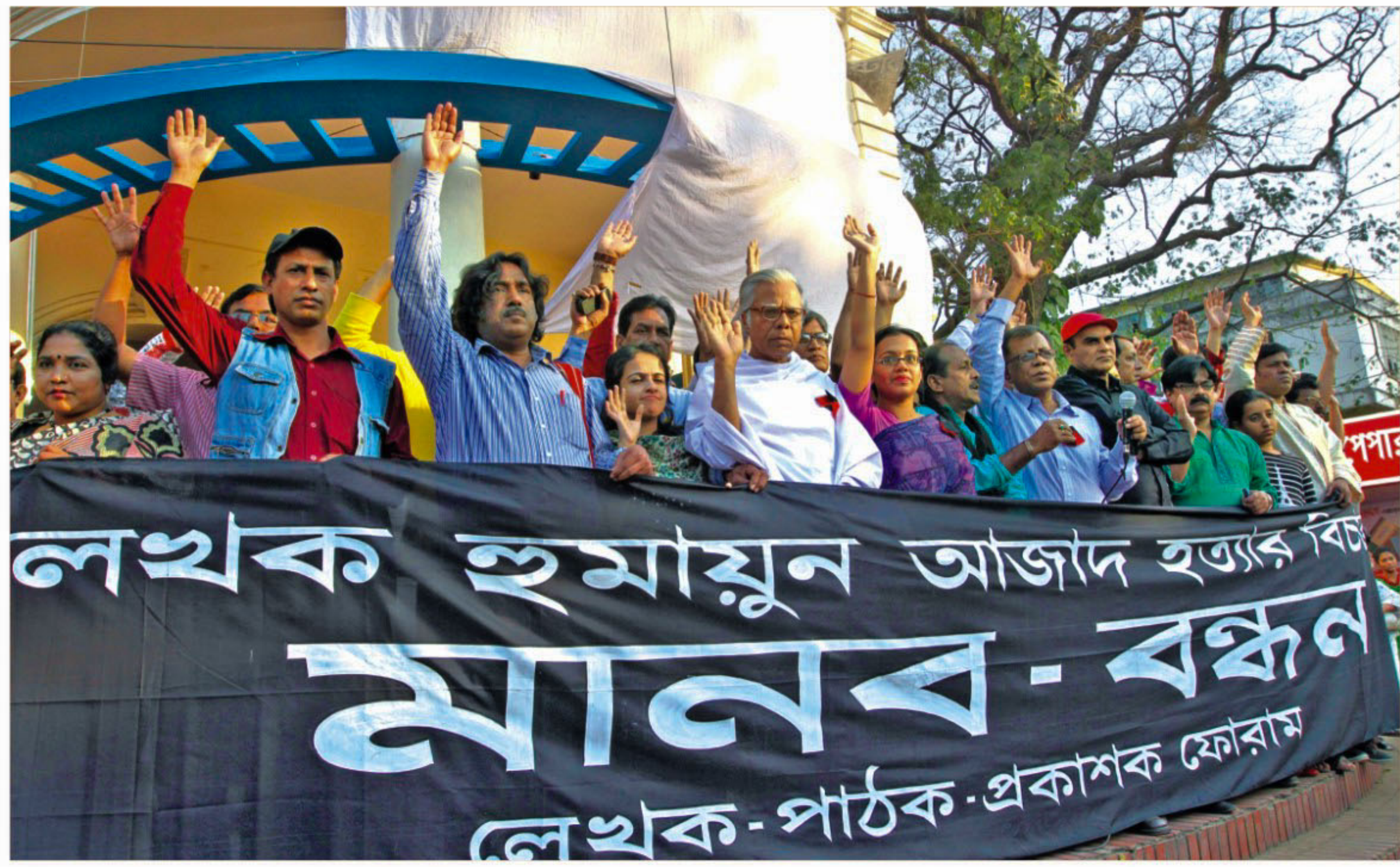
Writers, poets, publishers, fans and family members of Prof Humayun Azad raise their hands while observing a one-minute silence at a human chain before Amar Ekushey Bô Mela's information centre at the Bangla Academy premises in the city yesterday demanding an expeditious end to the trial of the case on the murder attempt on the writer.

Meanwhile, a total of 85 new books arrived at the fair yesterday. A discussion and cultural programme were held in the evening. The month-long festival, scheduled to end tomorrow, witnessed a low turnout yesterday.