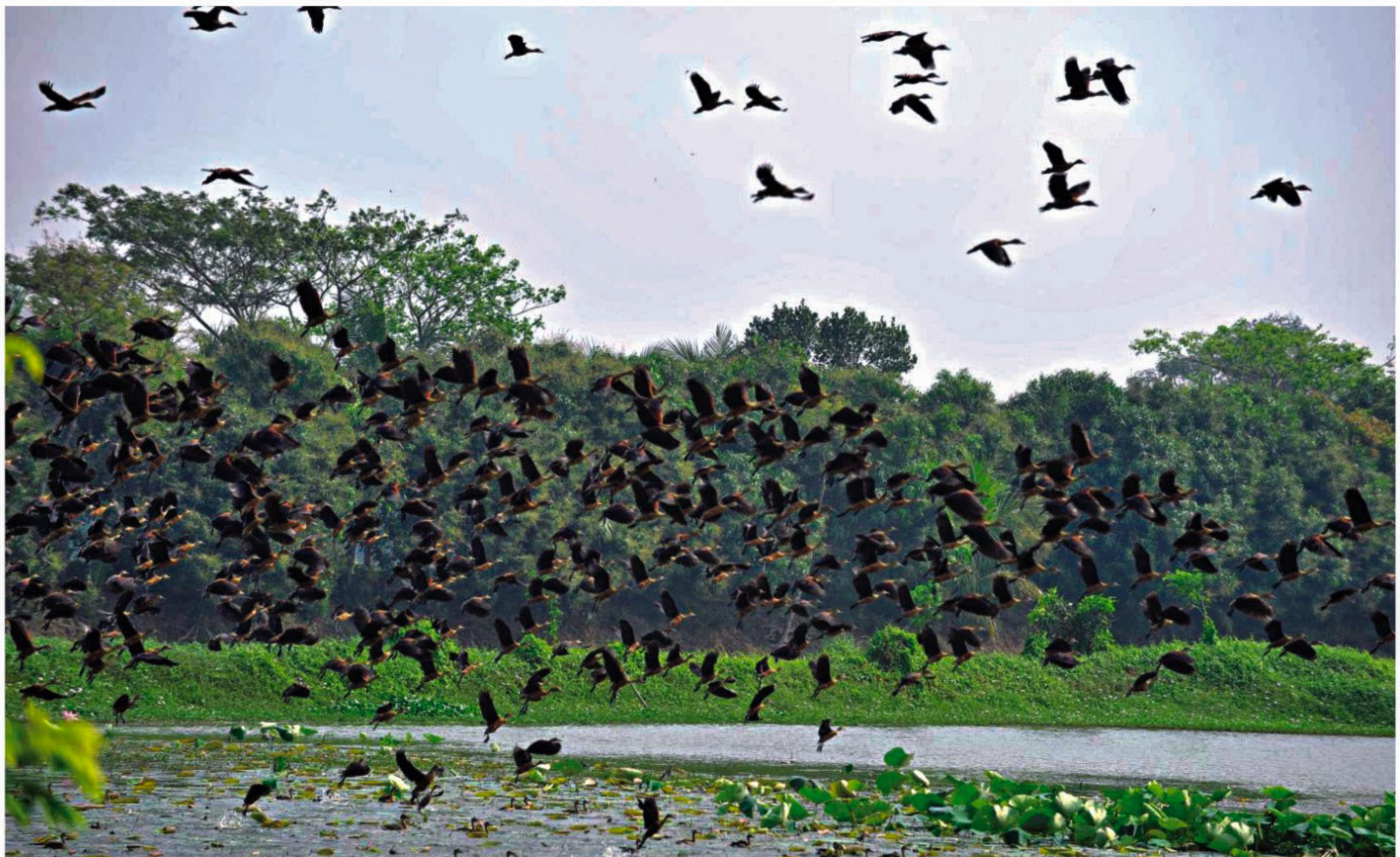
There is always the sight and sound of birds in Panipara village of Narail. Locally known as Pakheer Gram (a village of birds), the place has become a haven for thousands of migratory birds. Nature lovers and bird watchers have grown fond of the village. The photo was shot yesterday.