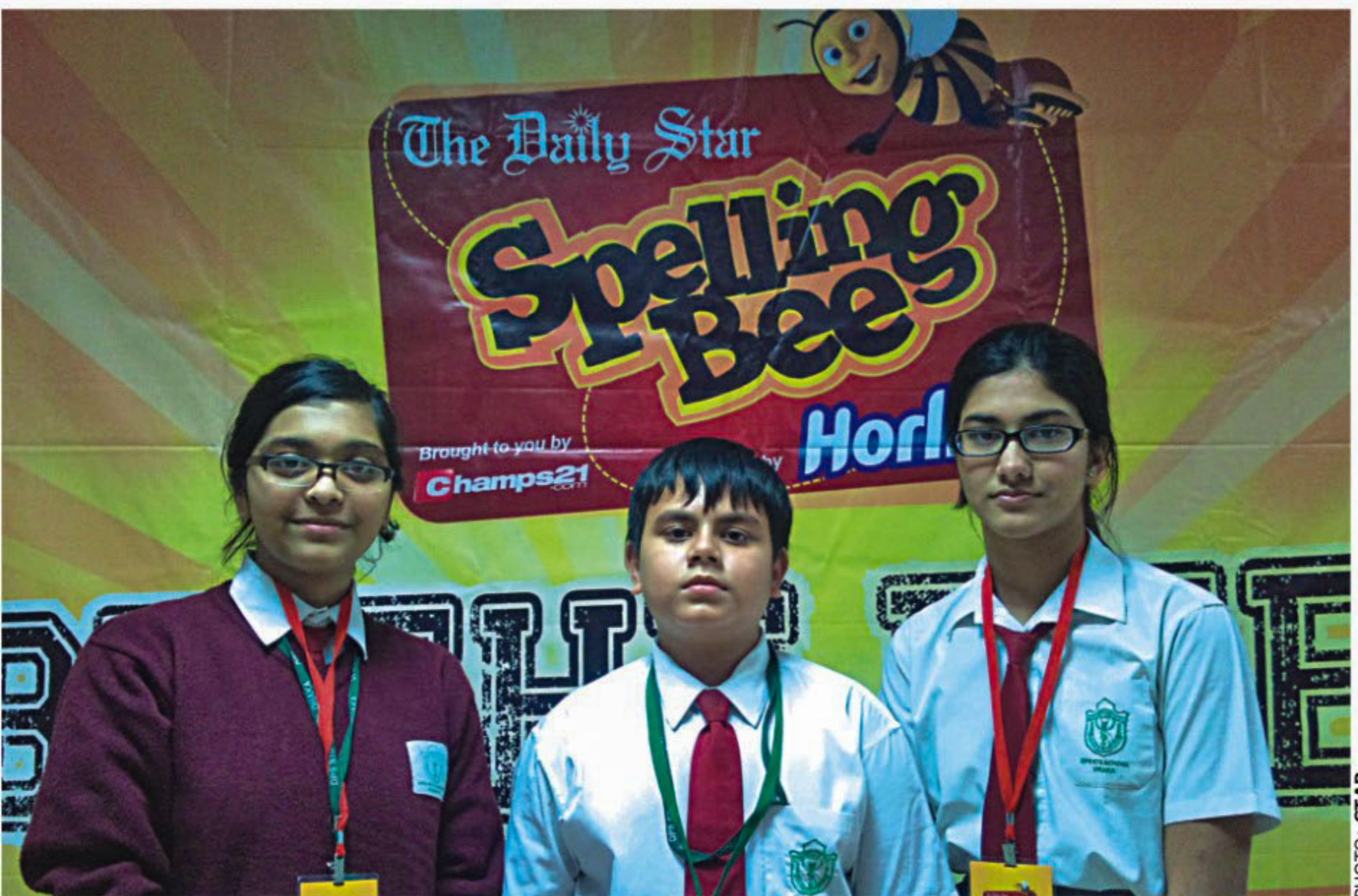
Three Spelling Bee contestants from Delhi Public School.