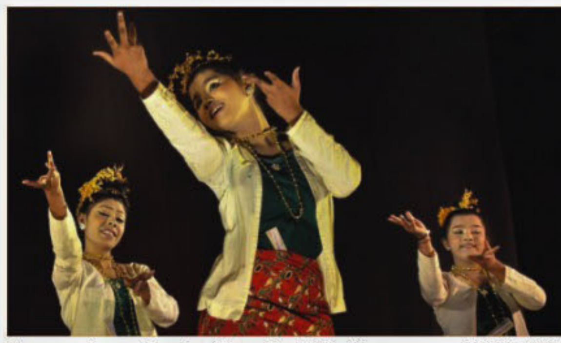
A scene from "Amina Shundori" (top).

The festival enabled the audience to savour the diverse