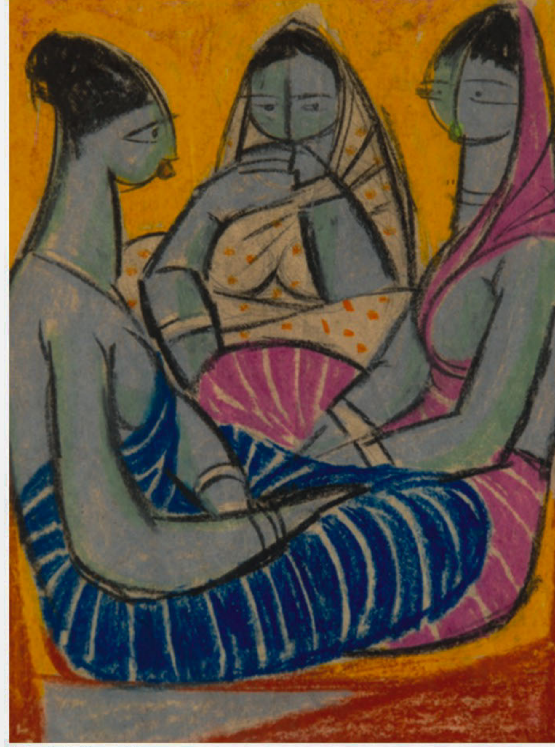
Artworks by Quamrul Hassan