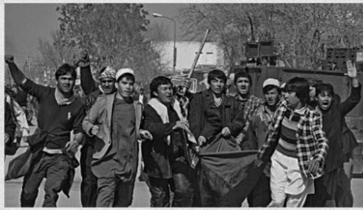
Protesters carrying a wounded compatriot during the protest

city and several buildings being set alight.