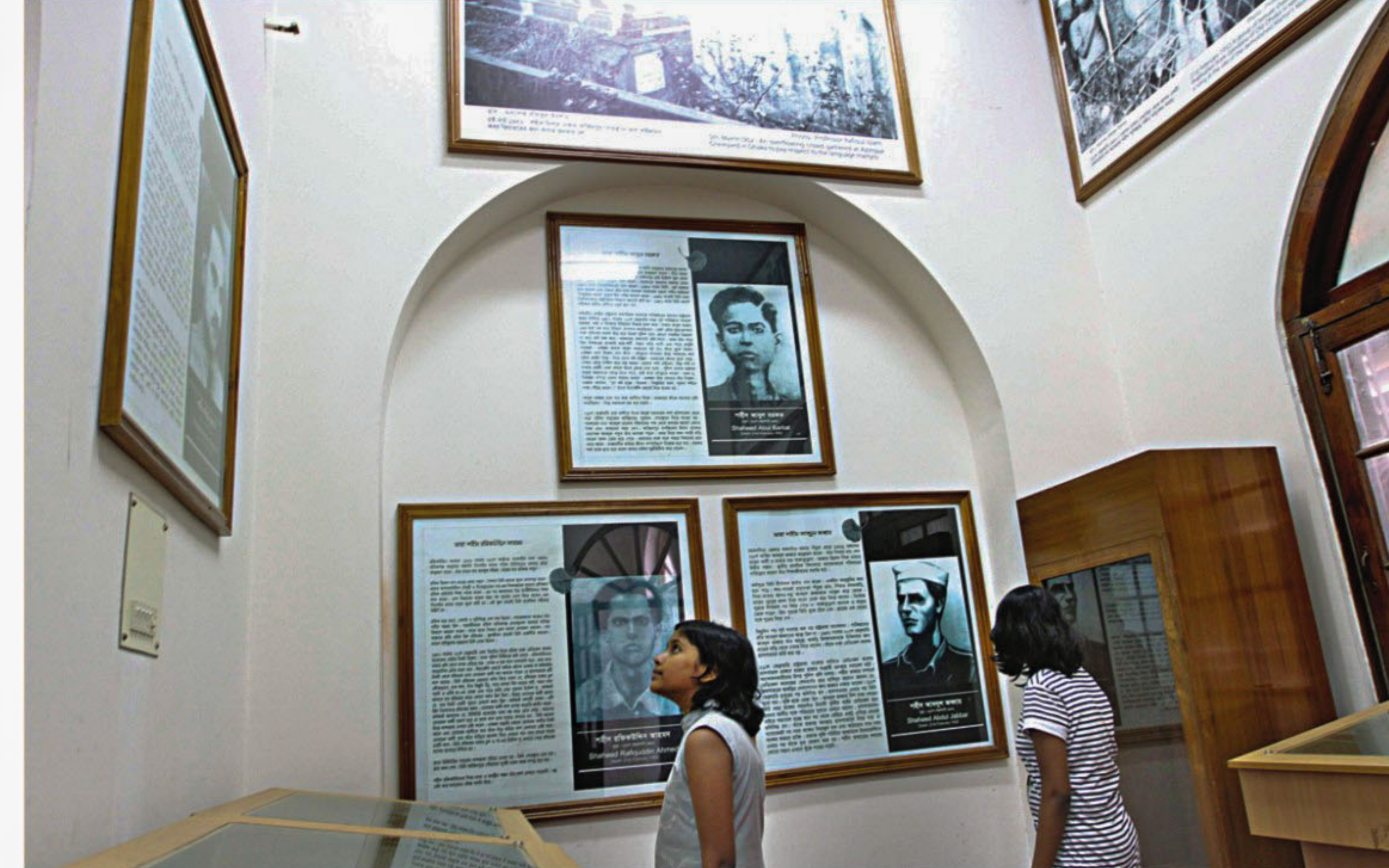
A section of 'Bhasha Andolan Jadughar' (Language Movement museum) on the first floor of the historic Burdwan House inside Bangla Academy in the city yesterday.