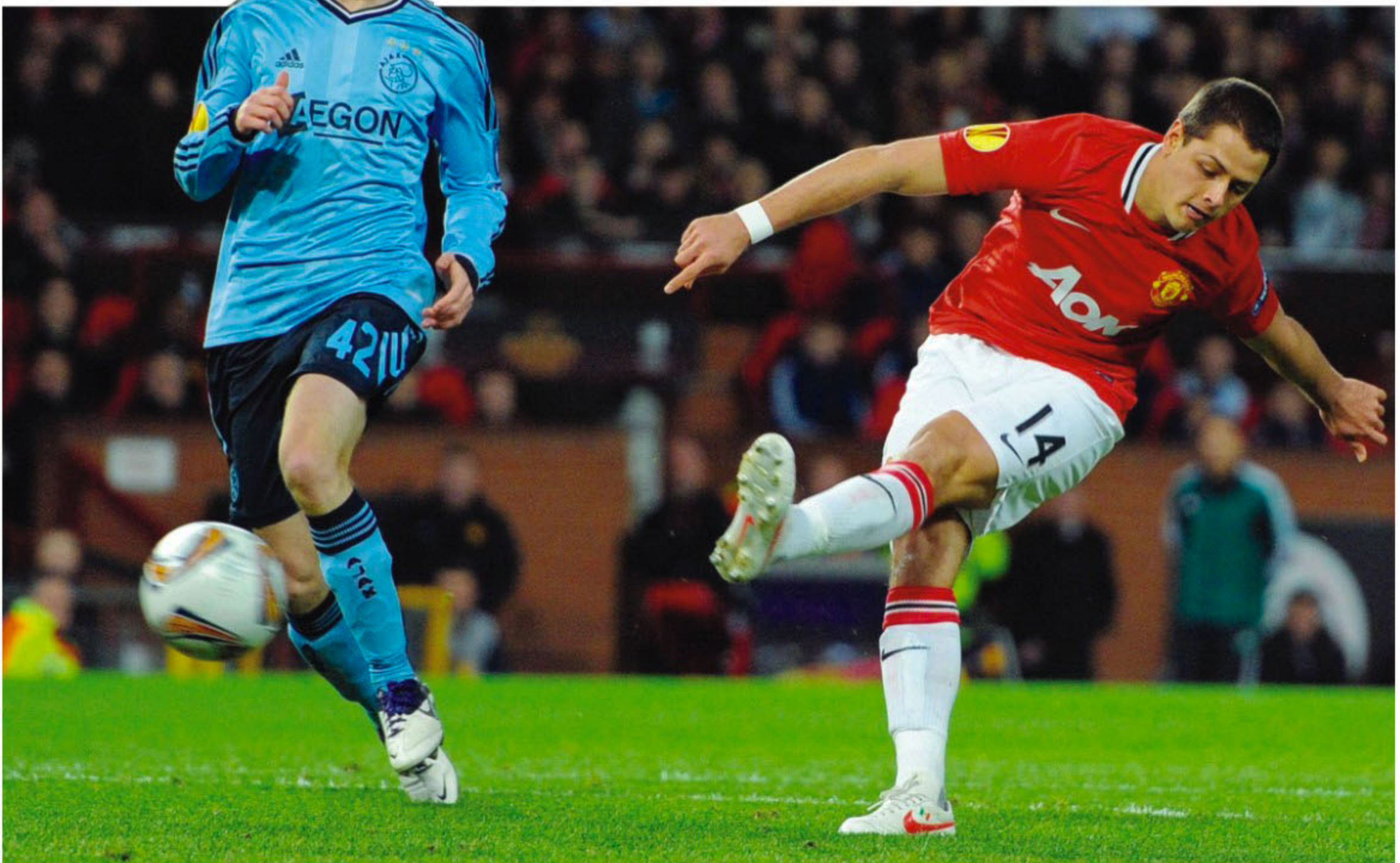
Manchester United striker Javier Hernandez (R) scores the opening goal against Ajax during their Europa League second round encounter at Old Trafford on Thursday.

AFP, Paris Manchester United squeezed through to the Europa League last 16 on Thursday despite losing 2-1 to Ajax at Old Trafford while former champions Atletico Madrid became Spain's third team in the next stage. Sir Alex Ferguson's United went through 3-2 on aggregate and will face Athletic Bilbao in the next round. Mexican star Javier Hernandez scored his 10th goal of the season after six minutes but Ajax threatened to spoil the party when Aras Ozbiliz levelled in the 37th minute and Toby Alderweireld headed a 87th-minute second leg winner. Valencia joined Bilbao and Atletico, who saw off Lazio 4-1 on aggregate, in the next round when a 1-0 win over Stoke City gave them a 2-0 aggregate win. Brazilian Jonas struck the only goal in the 24th minute which was never challenged by the English Premier League side. The Spanish side now face PSV Eindhoven, who should prove formidable opponents after a 4-1 hammering of Trabzonspor for a 6-2 aggregate over the Turks. Already trailing 2-1, Trabzonspor's task got even tougher as early as the 15th min-