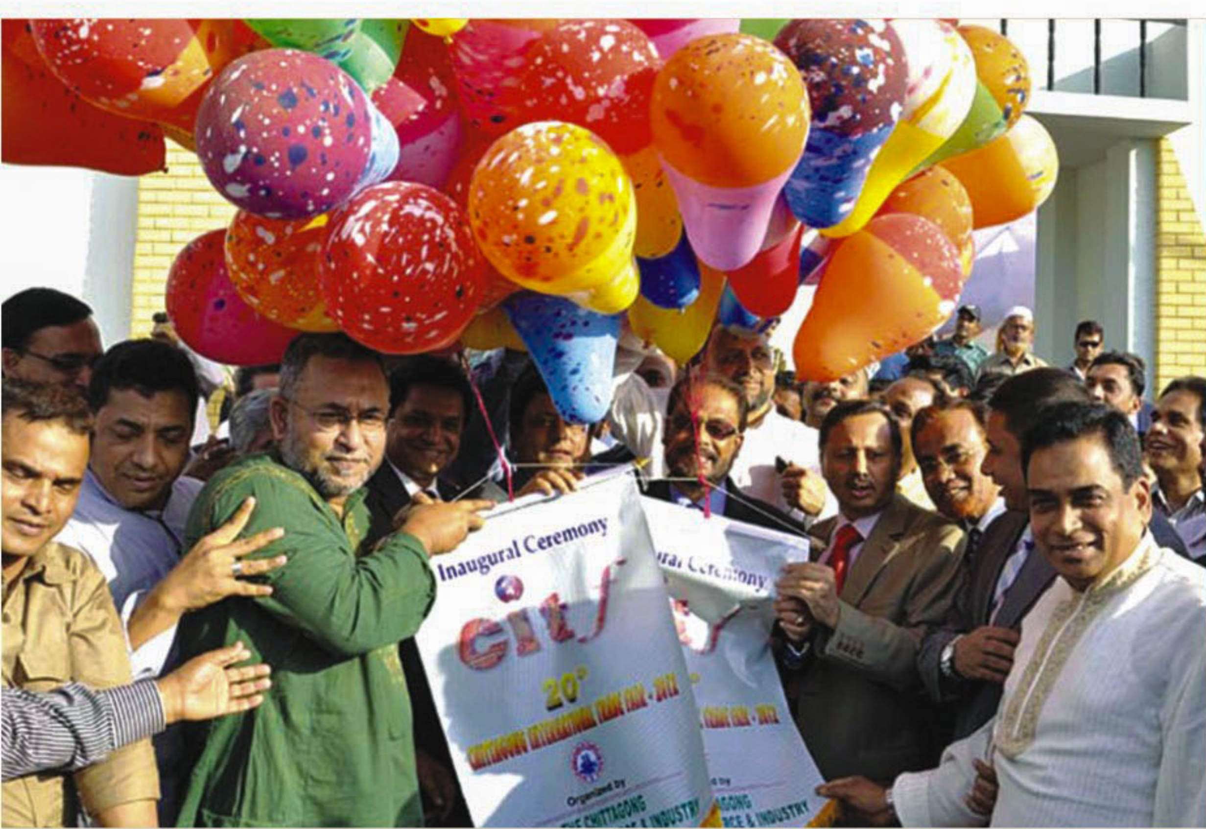
Commerce Minister Ghulam Muhammed Quader releases balloons to inaugurate the international trade fair in Railway Polo Ground in Chittagong city yesterday.

The court also fined six motorcycle riders Tk 2,700 for failing to show valid documents and for not using helmets.