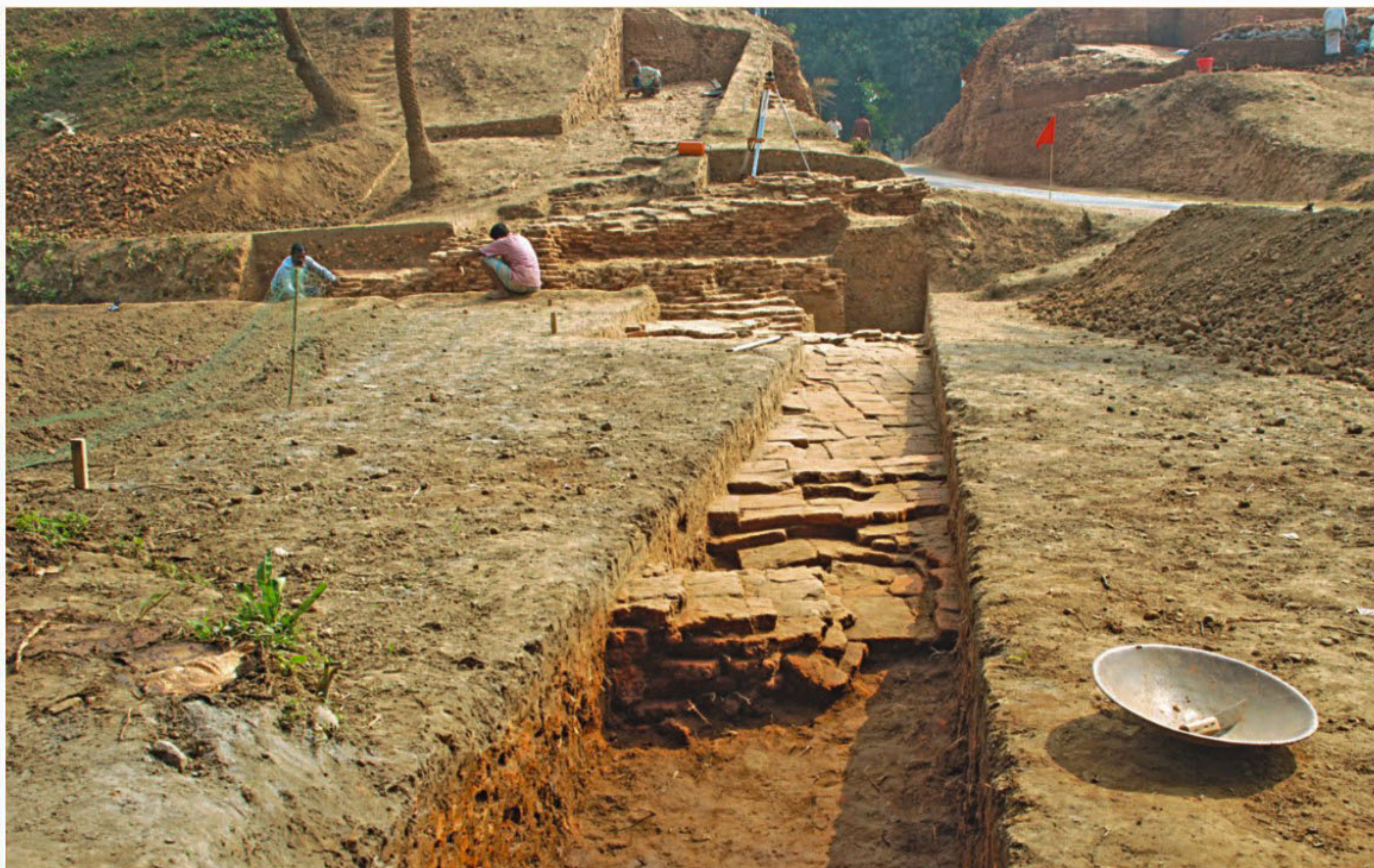
The site where archaeologists discovered an earthen wall and different objects of the Maurya, Gupta and Pal dynasties in Mahasthangarh of Bogra district last week.

Sources said she has been suffering from acute knee problem for long. Her condition deteriorated when she led a mass procession in the city on January 30. As local doctors suggested her taking better treatment without further delay, she has decided to go to the country.