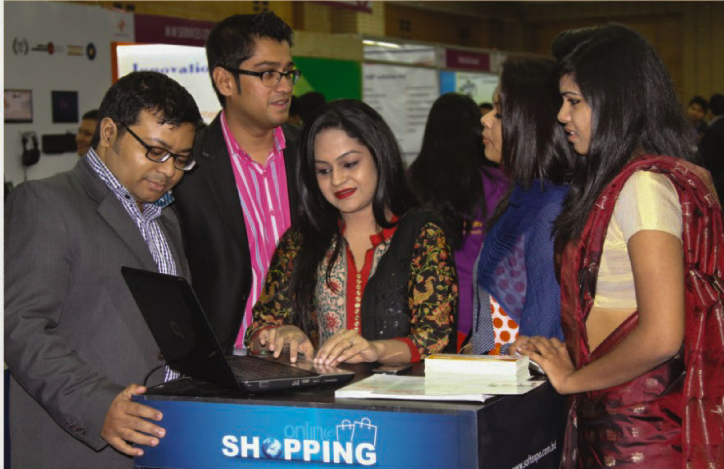
Visitors look at an online service at a stall at the fair.

Feroze said he used Speech Recognition System and own algorithm to make this Robot. In other words you can use voice command to communicate with the robot. "It can communicate with people easily. Even a kid can communicate with it providing the proper training."