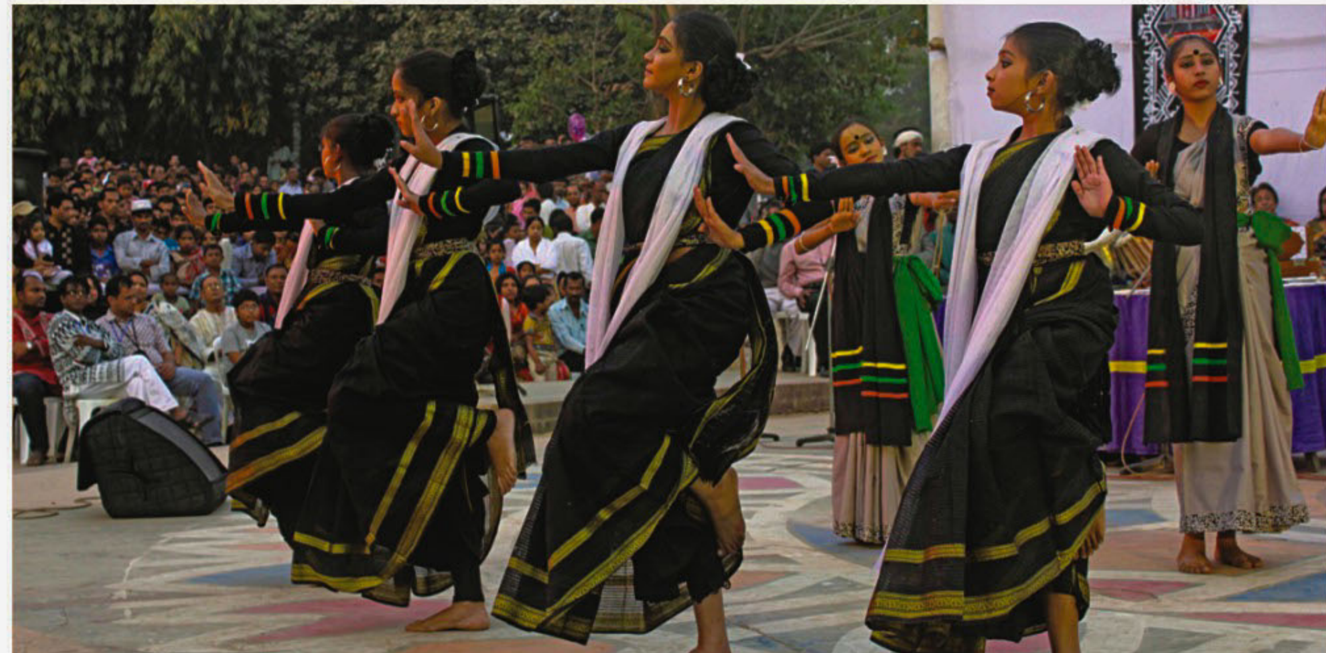
Artistes dance at the event.

Established in London, UK, Bengali International has branches in America, Australia and Africa. The organisation has been functioning for the last 35 years.