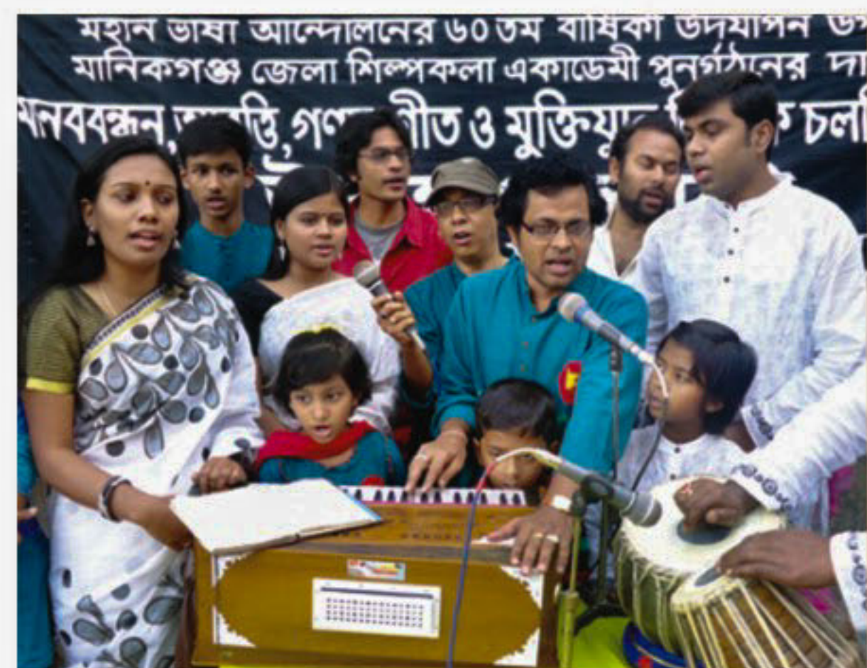
Musical performance prior to the show.