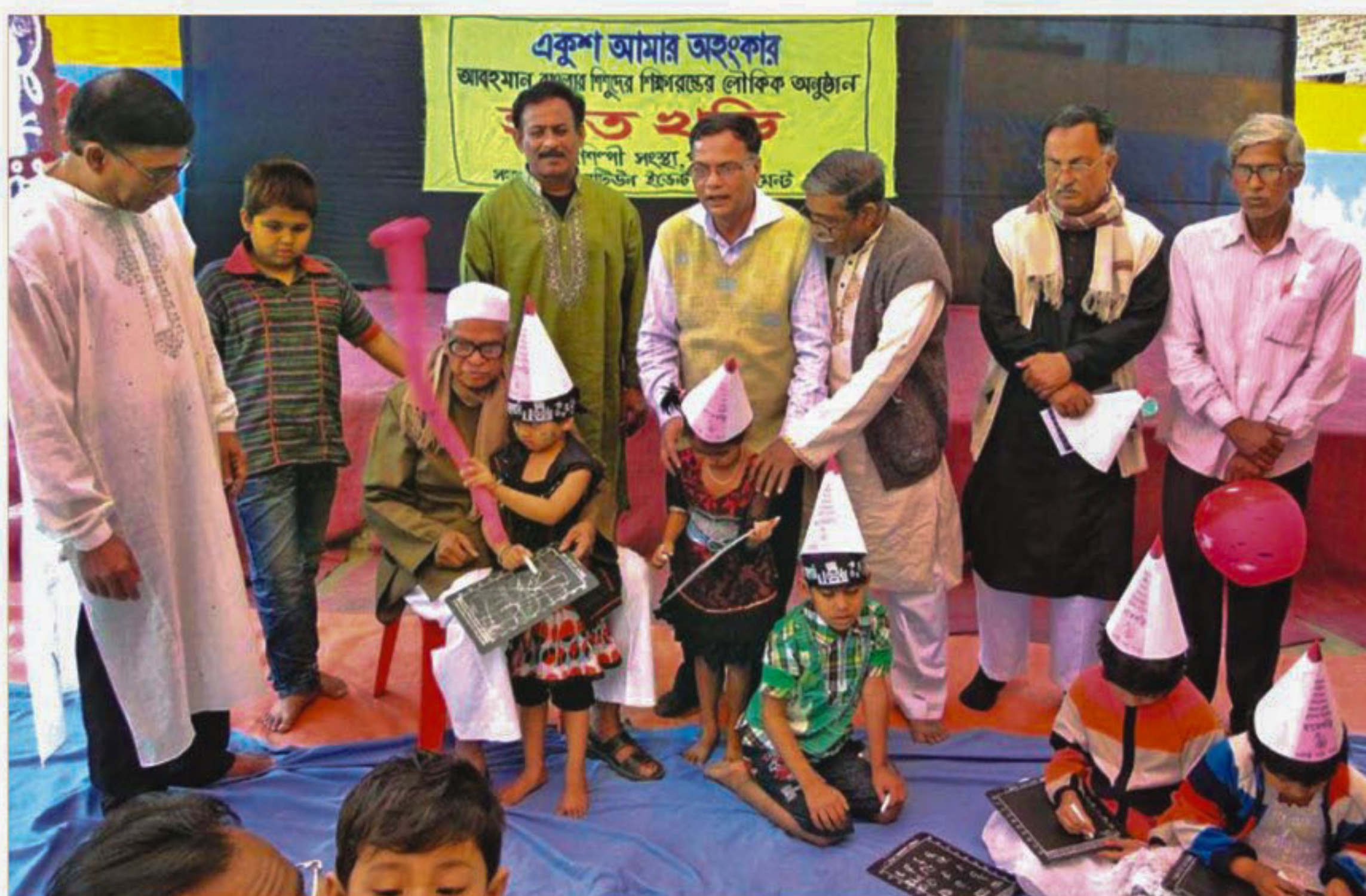
Children at the 'Hatekhari' programme.