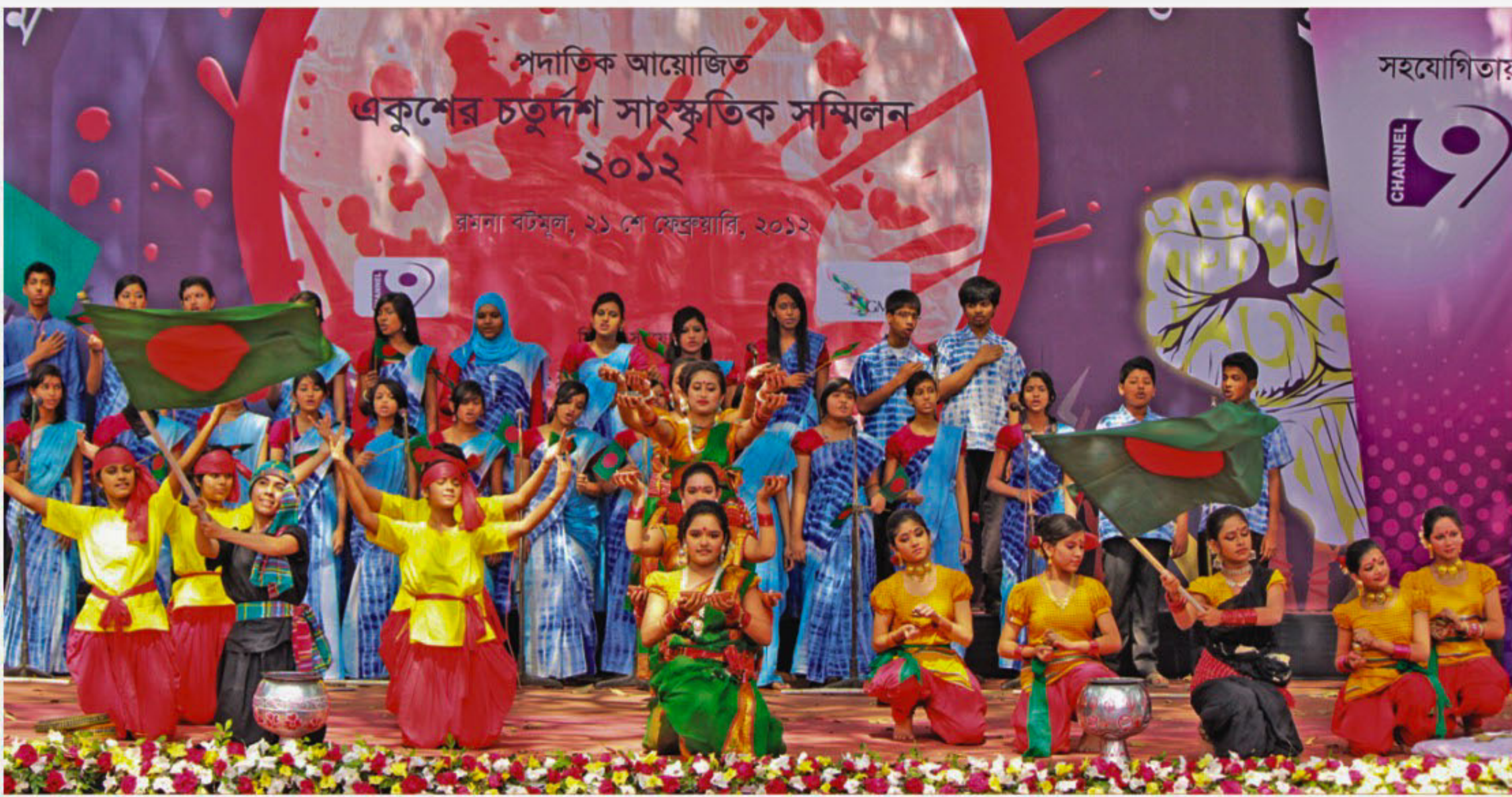
Students of Bangladesh International Tutorial (BIT) perform at the event.