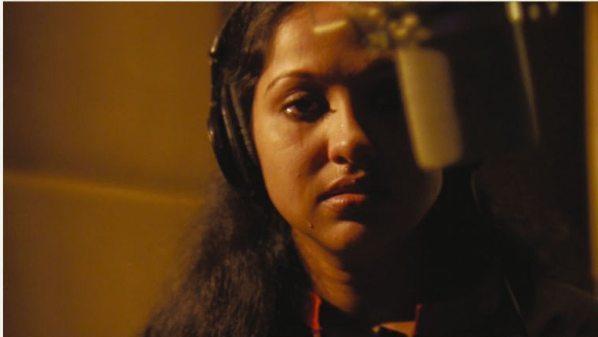
A scene from the film.