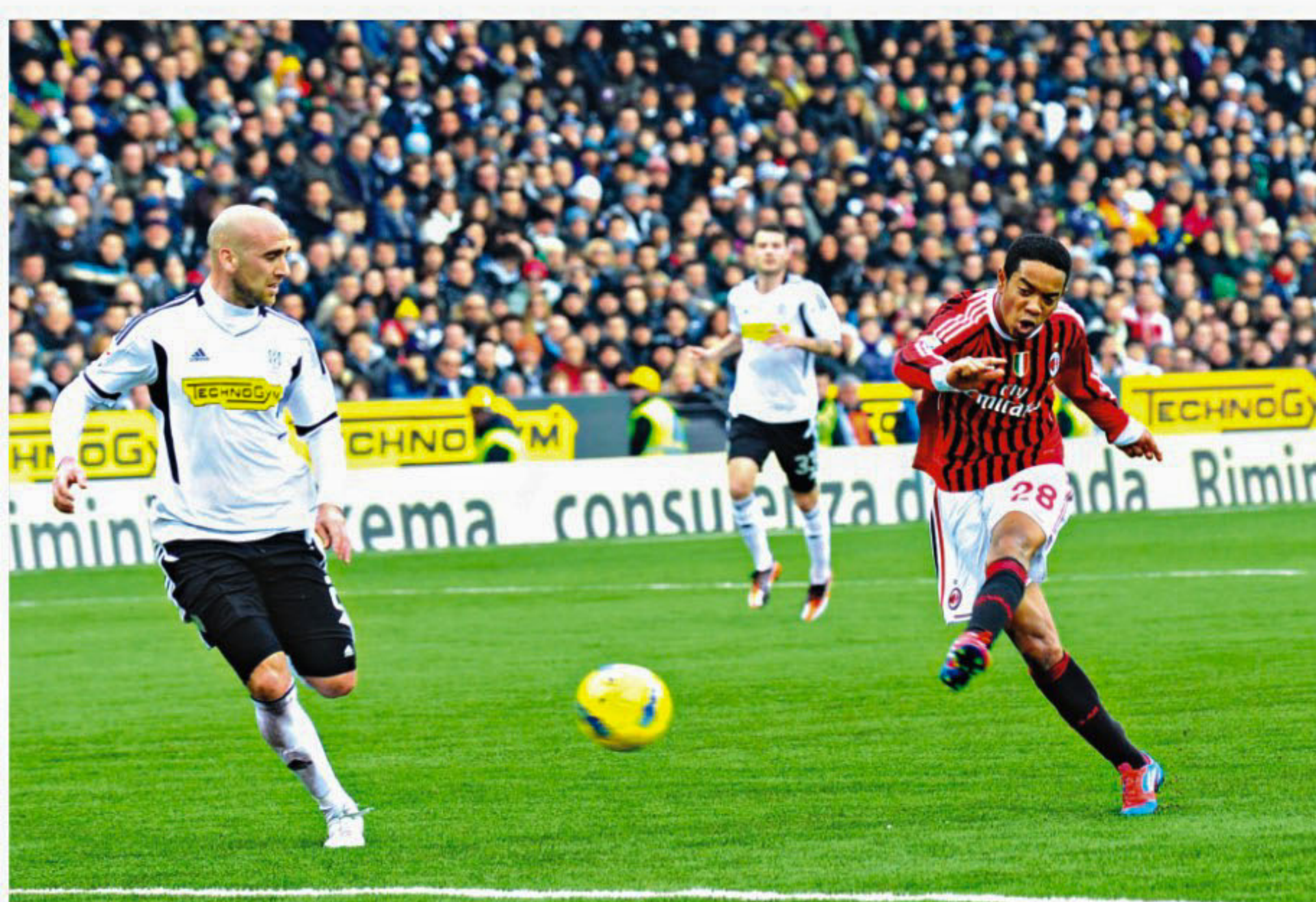
AC Milan midfielder Urby Emanuelson (R) scores the second goal against Cesena during their Serie A clash in Cesena on Sunday.

The dominant teams in this season's Premier League, Manchester rivals United and City, both crashed out in the group stages while Arsenal's 4-0 thrashing at AC Milan last week even had their manager Arsene Wenger admitting they had no chance of progressing.