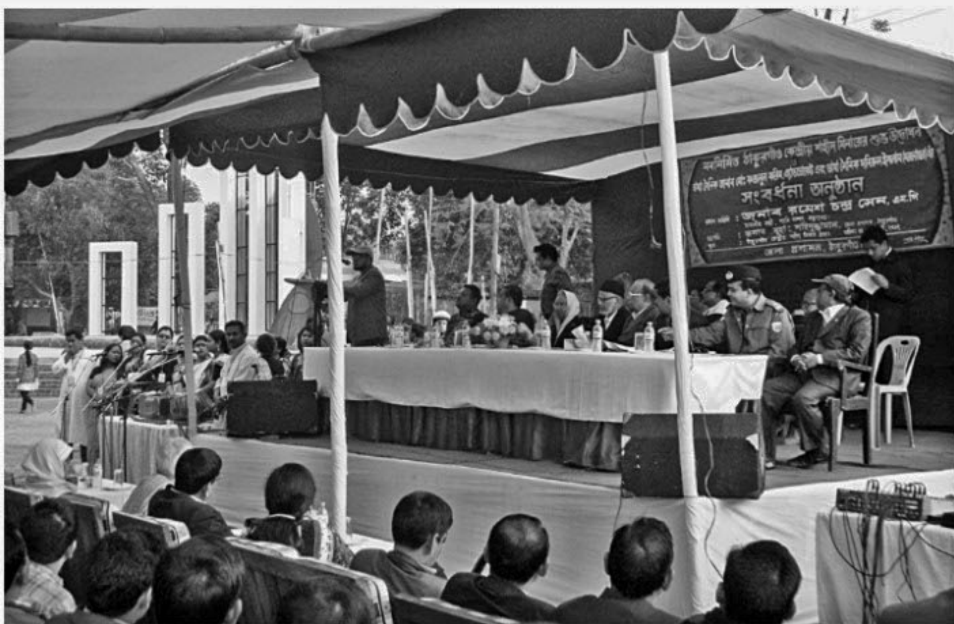
With the inauguration of the district's Central Shaheed Minar at Thakurgaon Government Boys' High School ground yesterday, the long-cherished dream of the townspeople has come true. Photo shows the inaugural function.