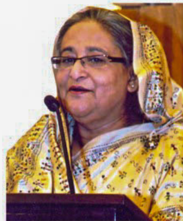
Prime Minister Sheikh Hasina addresses Panchagarh party leaders at her official residence Gono Bhaban yesterday.

About the comparison of the Awami League with the BNP by some quarters on the caretaker government issue, Hasina said the AL had demanded the caretaker system after witnessing the