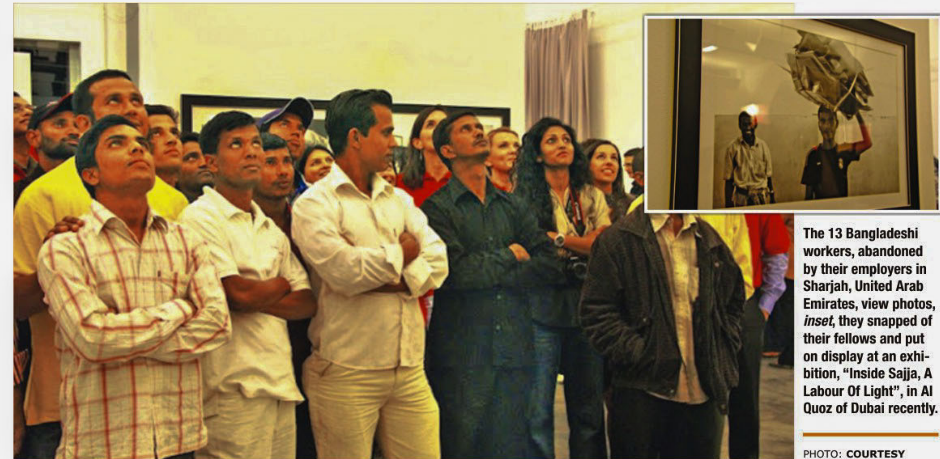
The 13 Bangladeshi workers, abandoned by their employers in Sharjah, United Arab Emirates, view photos, inset, they snapped of their fellows and put on display at an exhibition, "Inside Sajja, A Labour Of Light", in Al Quoz of Dubai recently.