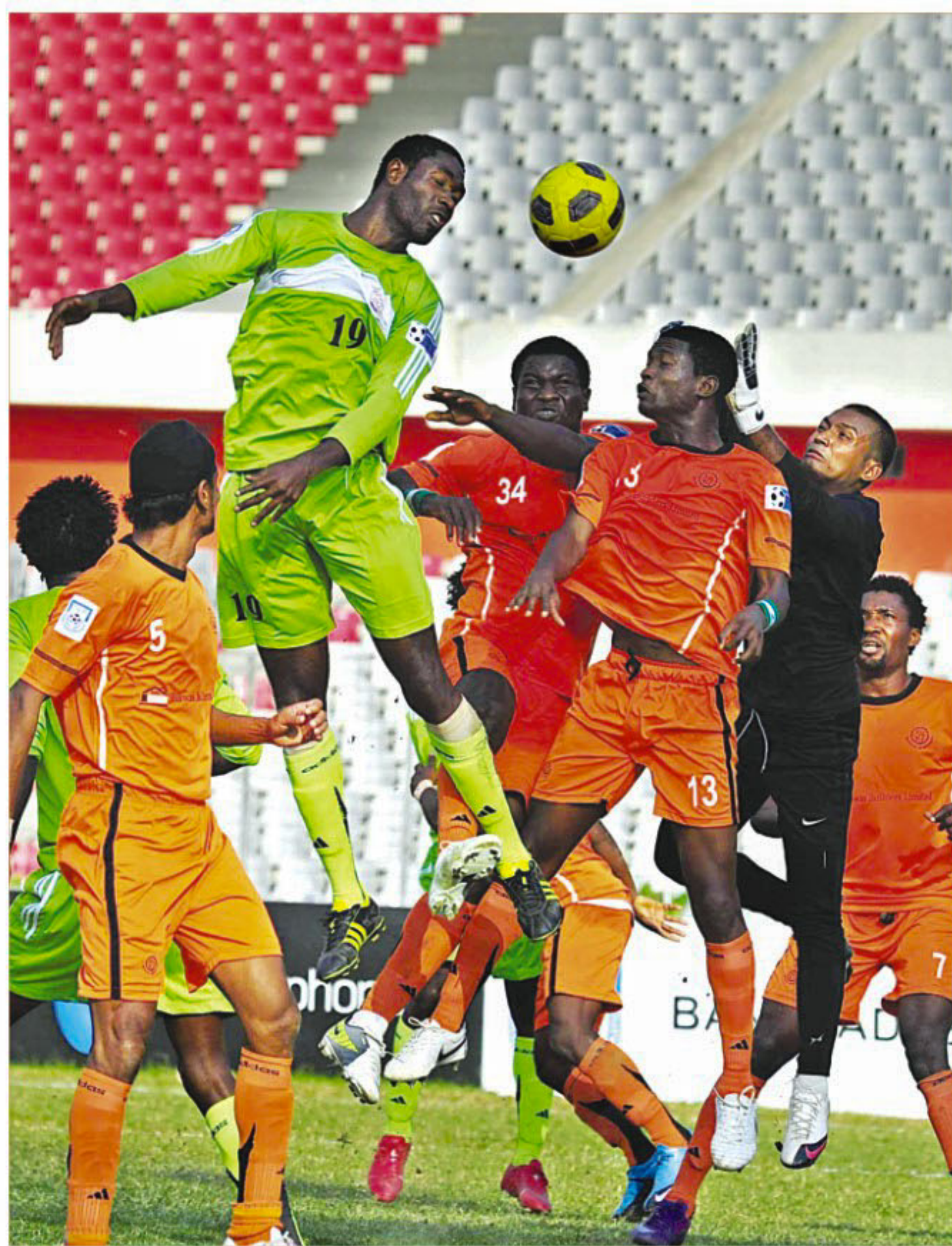
Brothers Union and Team BJMC players engage in an aerial tussle during their Bangladesh Premier League encounter at the Bangabandhu National Stadium yesterday.