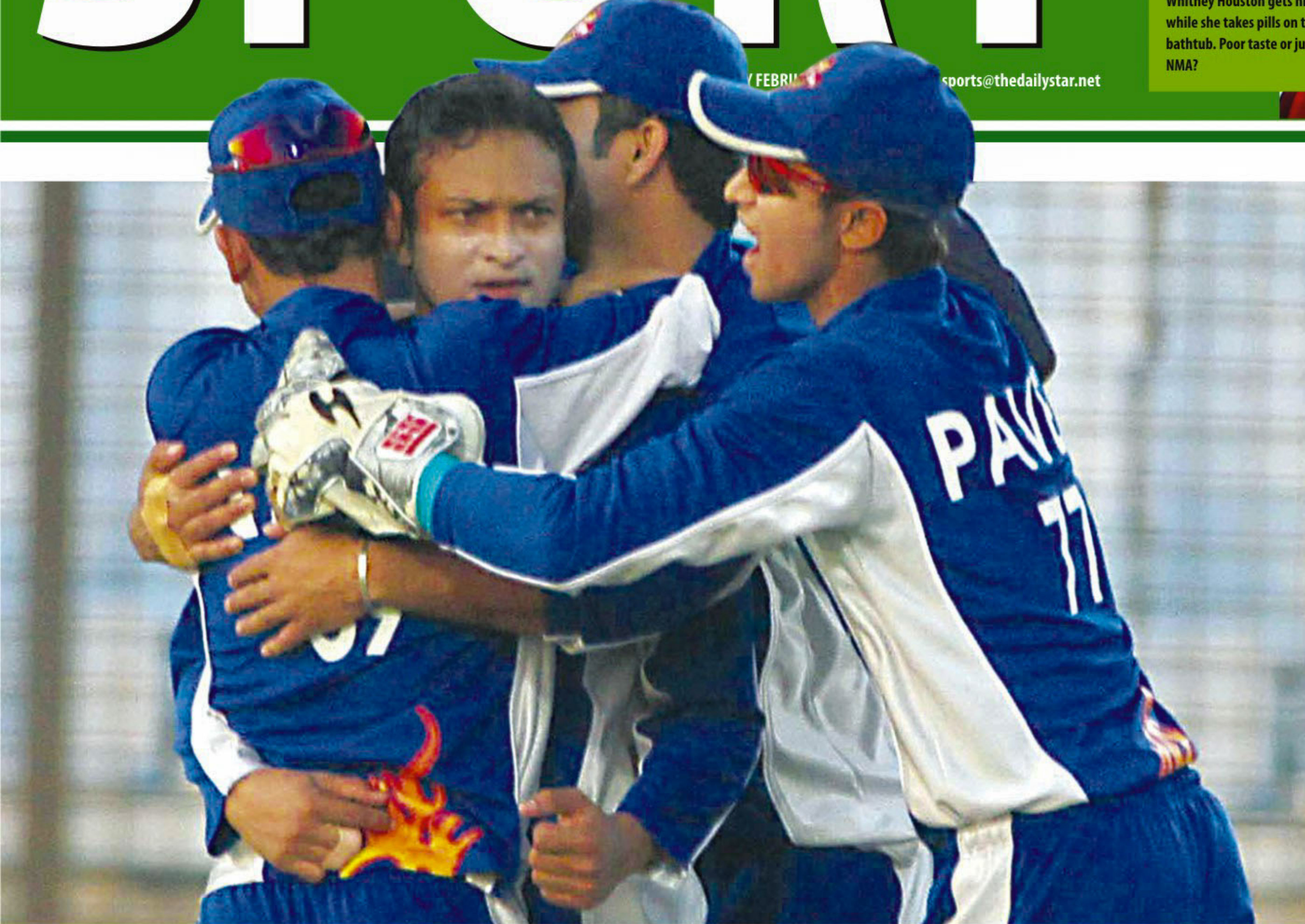
Khulna Royal Bengals captain Shakib Al Hasan (C) is mobbed by his teammates after his match-winning final over against Sylhet Royals in the BPL T20 at the Zohur Ahmed Chowdhury Stadium in Chittagong yesterday.