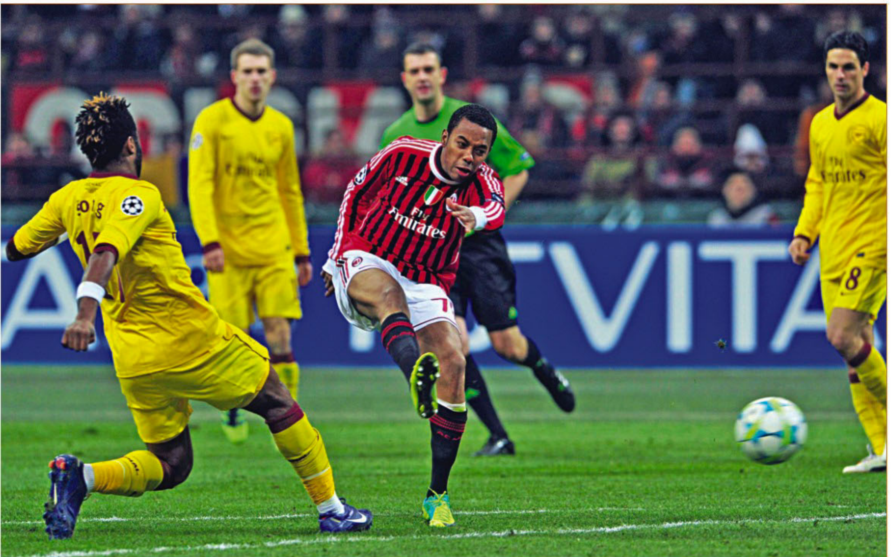
AC Milan forward Robinho (C) scores his second goal against Arsenal during their Champions League second round encounter at San Siro on Wednesday.

Milan were ripping Arsenal apart on the counter and one such rapier attack with a three-on-two situation fell unfortunately to full-back Antonini whose finish was true to his occupation.