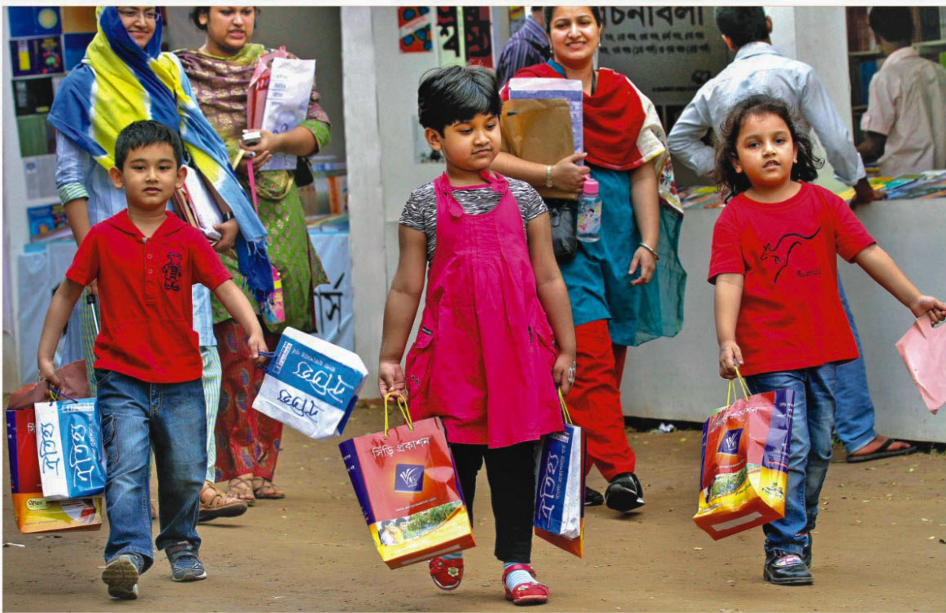
Kids leave Amar Ekushey Boi Mela premises with bags full of new books yesterday. The fair authorities dedicated the hours from 11:00am to 3:00pm of the day exclusively for children. Story on page 2