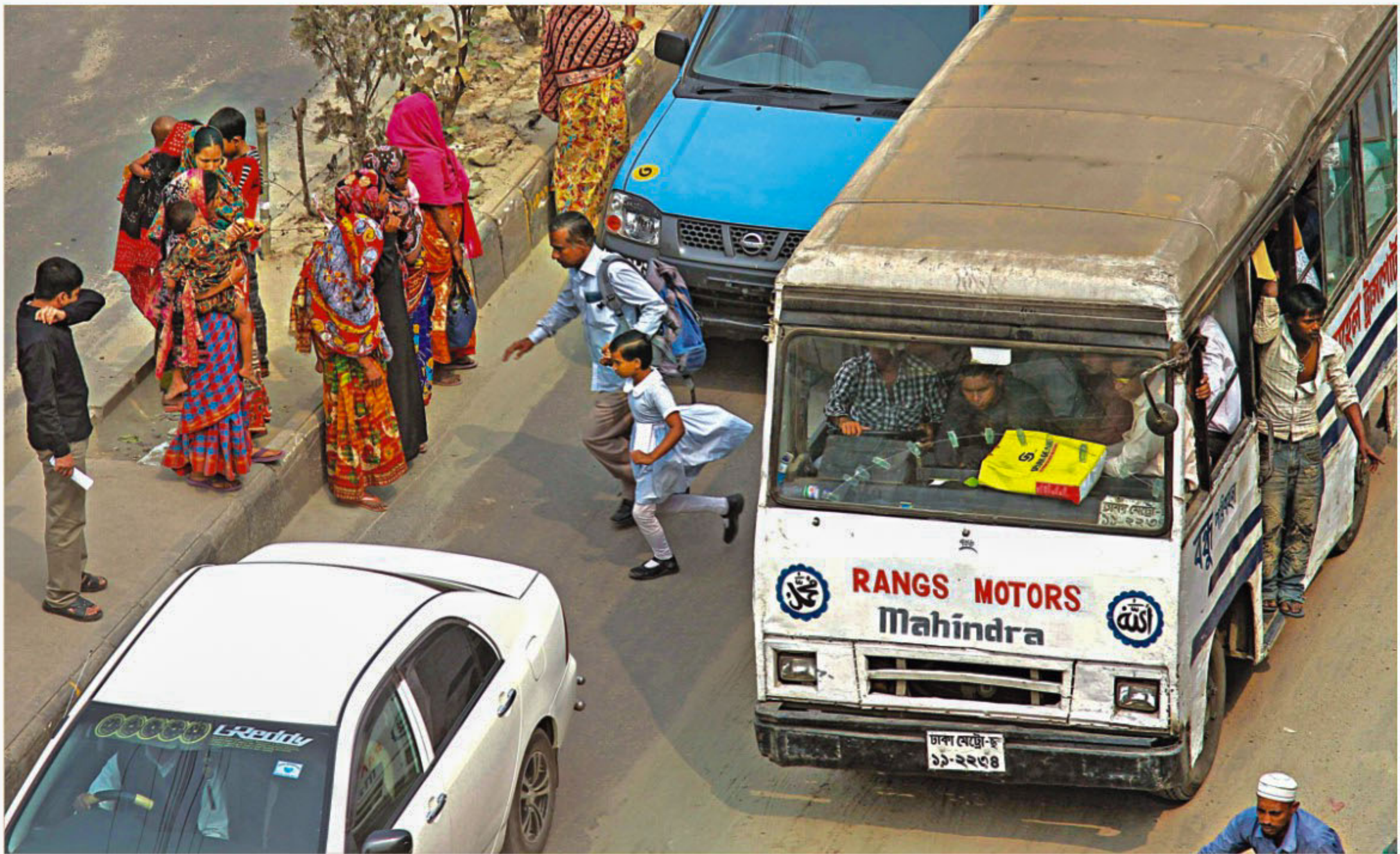
WHEN WILL THEY EVER LEARN? A man walks across the street dangerously, putting his life and also the life of the child at risk of a serious accident. The moment was captured in the capital's Rampura on Wednesday.