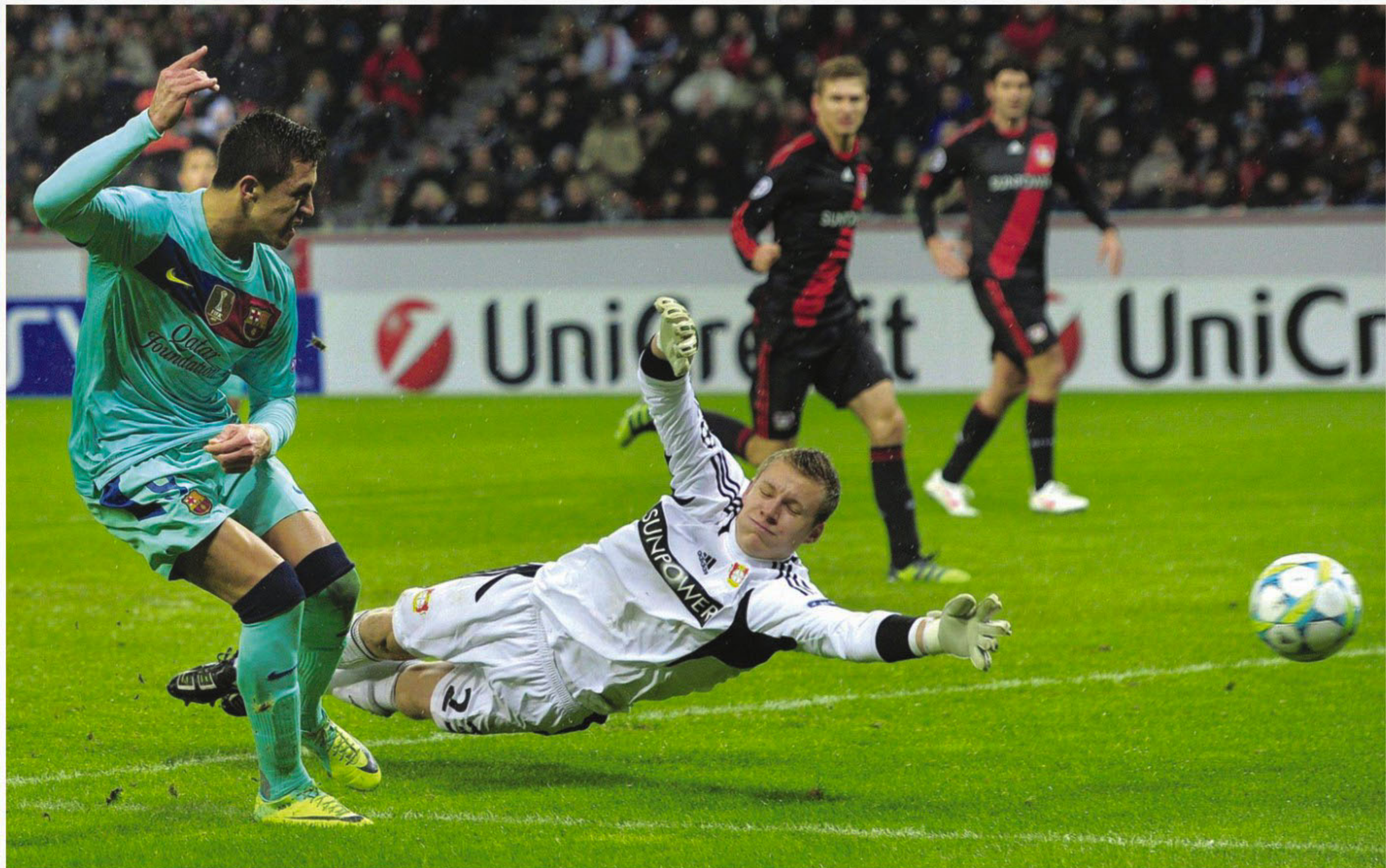
Barcelona striker Alexis Sanchez (L) scores one of his two goals against Bayern Leverkusen during their Champions League second round encounter at the Bay Arena on Tuesday.