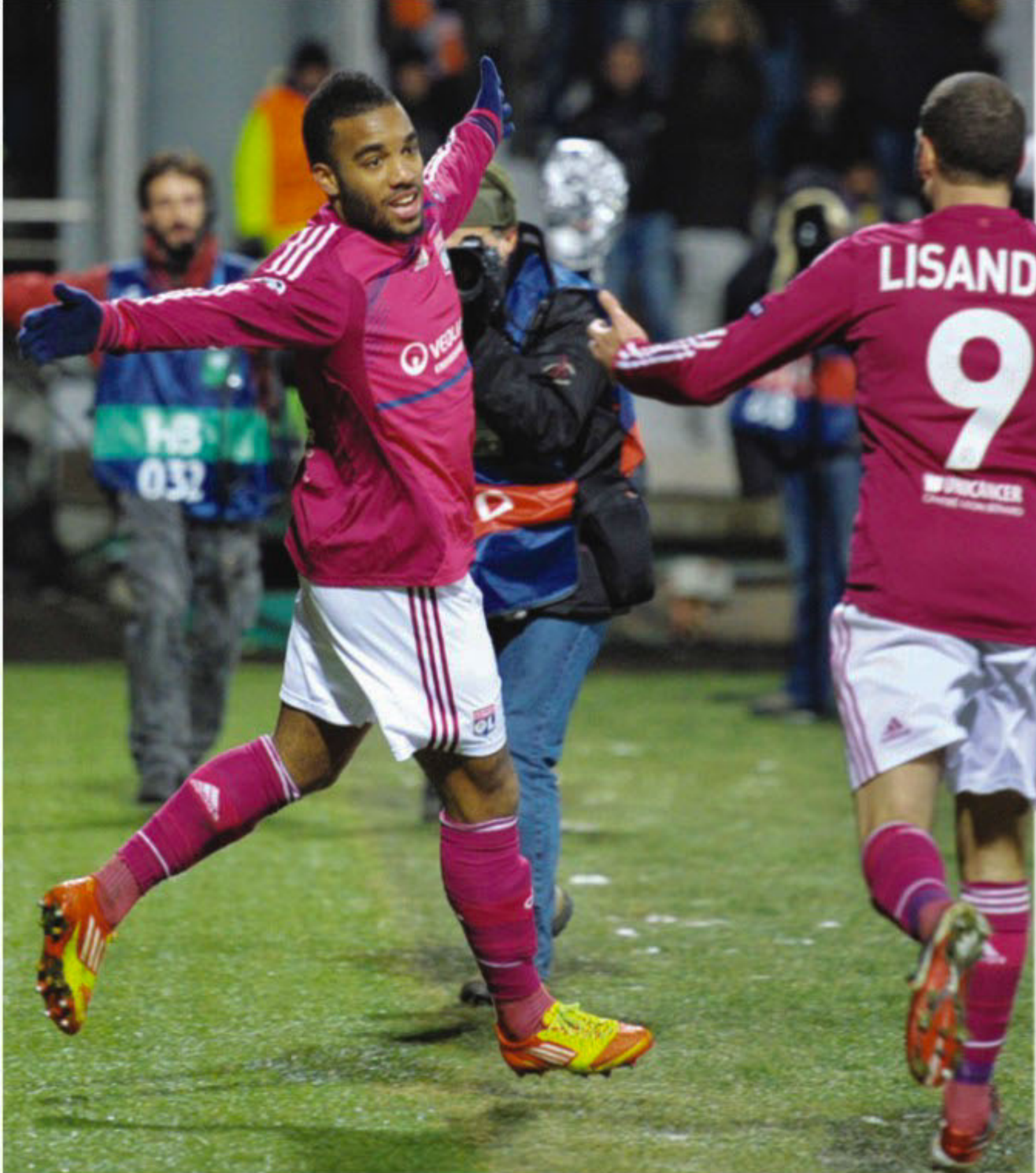
Lyon forward Alexandre Lacazette (L) celebrates his all-important goal with teammate Lisandro Lopez during their Champions League clash against Apoel Nicosia at the Gerland Stadium on Tuesday.

Brazil, not involved in the South American World Cup qualifiers as 2014 tournament hosts, also have friendlies against Denmark, the United States, Mexico and Argentina in the first half of this year.