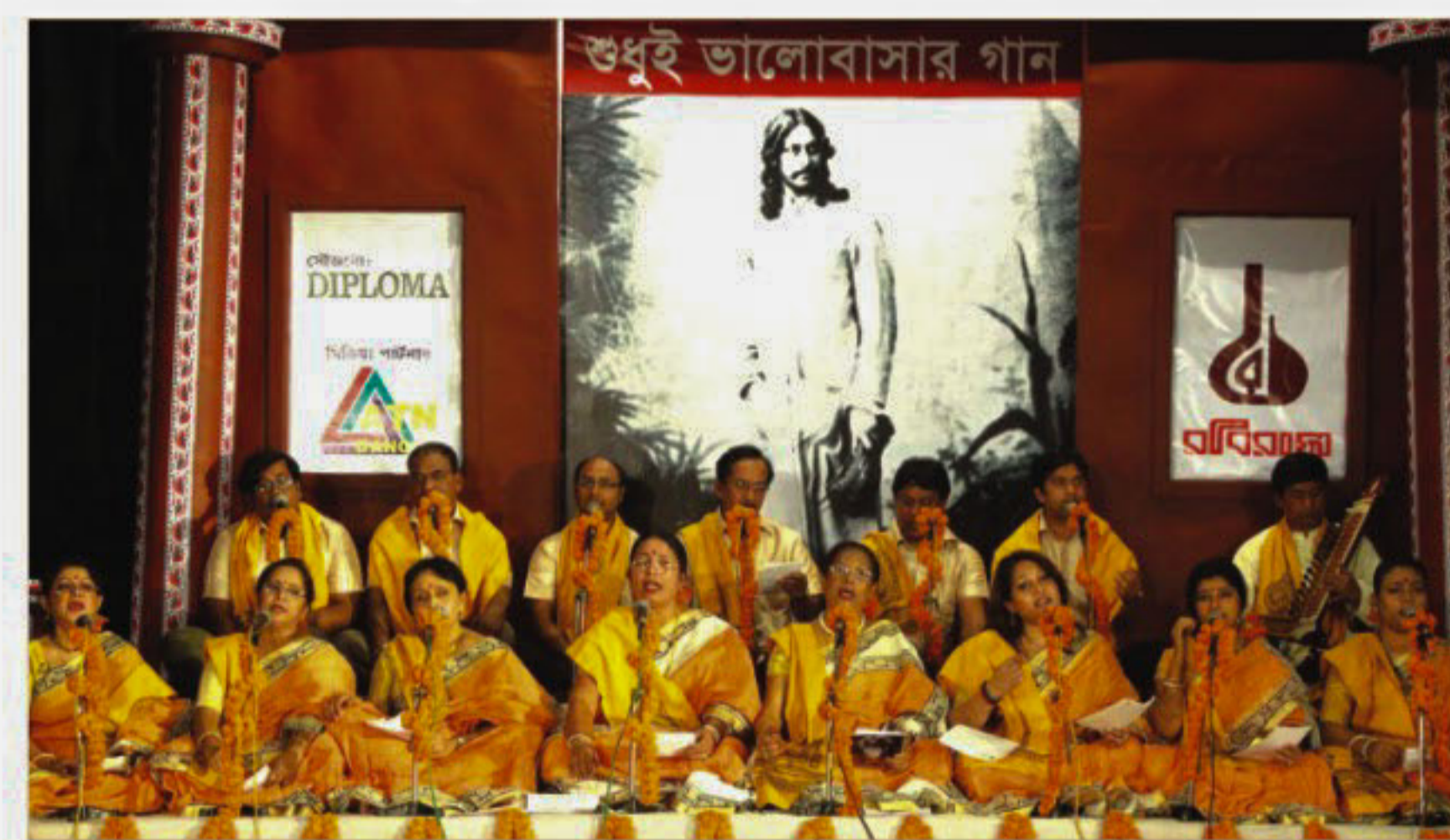
The programme blended the Western concept of celebrating 'love' on a particular day with the emotive Eastern way through music.

STAFF CORRESPONDENT To mark Valentine's Day, Rabirag held a musical programme at the National Music and Dance Centre Auditorium of Bangladesh Shilpakala Academy, on February 14. Featuring some of Tagore's romantic numbers; the programme blended the Western concept of celebrating 'love' on a particular day with the emotive Eastern way through music.