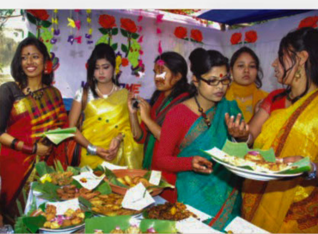
Enjoying rice cakes.