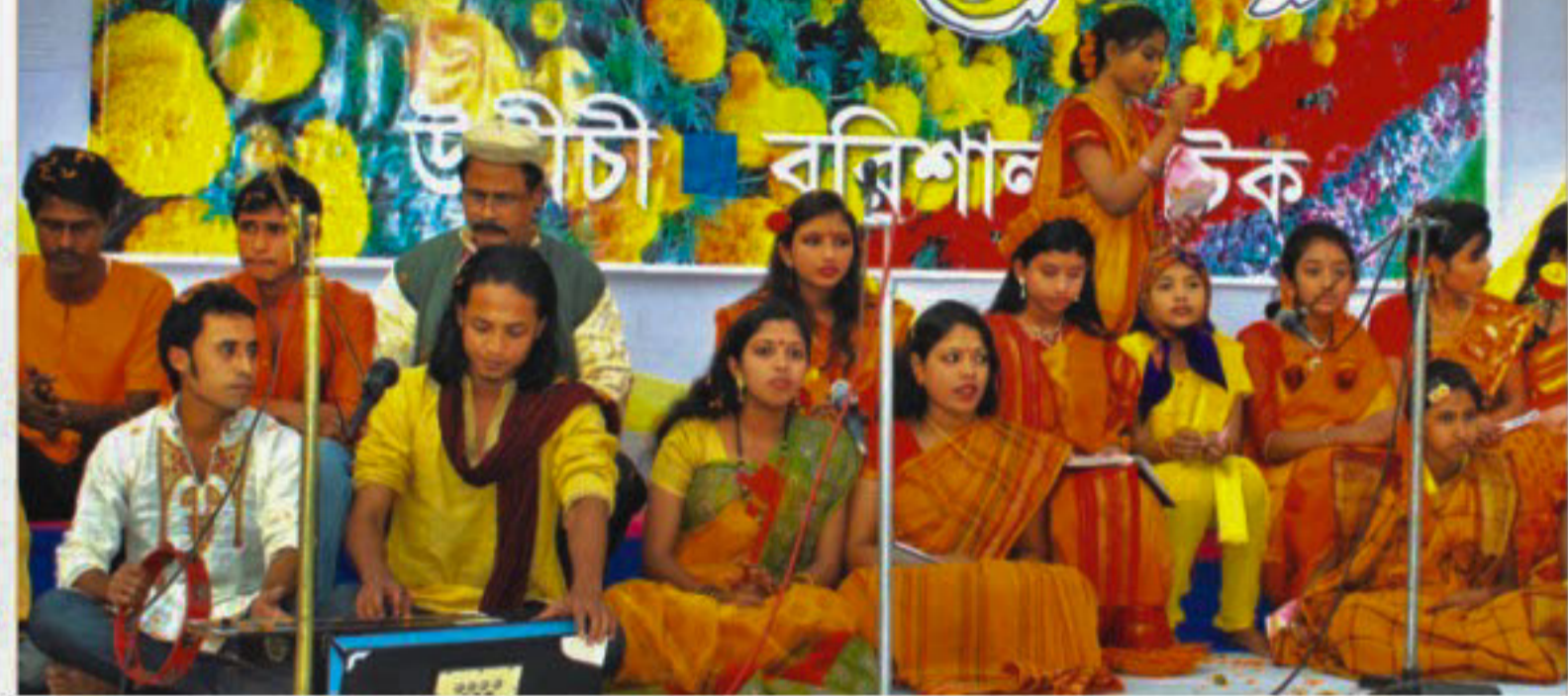
Bashanto (spring), the 'Queen of seasons' receives a warm welcome in Barisal on Monday with the call 'Let joy be showered on us in the ecstasy of spring'.

Sangskritik Jote at the Shaheed Minar premises on the campus. The students of Environmental Science and Resource Management (ESRM) department brought out a colourful procession at the campus marking the occasion. Students of the departments of the university also celebrated the day with various programmes.