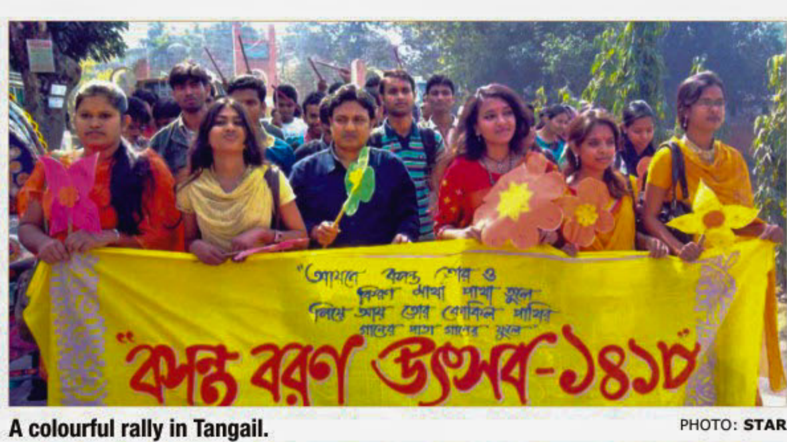
A colourful rally in Tangail.