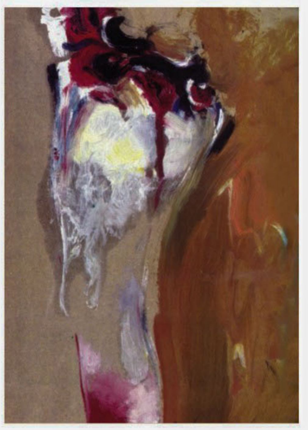
bold strokes. The canvas is fully occupied with large figures in different dimension and birds in cruel approach. The outlines are strong and colours are in varied layers.

"The National Flag" -- titled series where the painter significantly uses green and red the colours of our flag and other colours. In the series, Kajol shows how the conflict between the obvious and the real can be both illusory and critical. The exhibition ends on February 21.