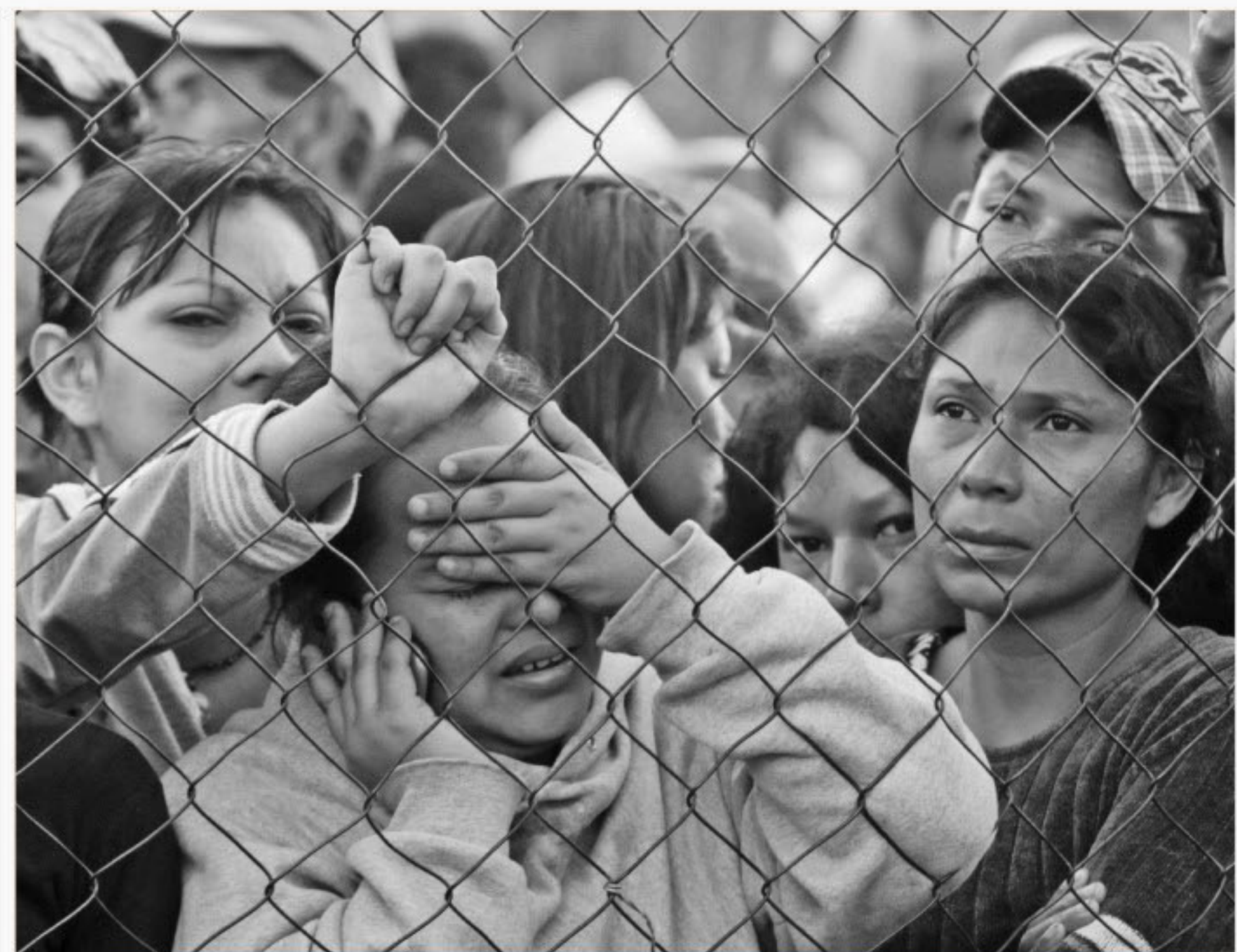
Relatives of inmates await outside the National Prison of Comayagua compound in Comayagua, Honduras, yesterday, where at least 272 prisoners were killed and scores injured when fire overnight tore through the prison in central Honduras, the Central American country's prisons director said. The prison held around 850 prisoners.

"The Iranian side is indeed making progress in its nuclear programme," he told the specialised journal Security Index.