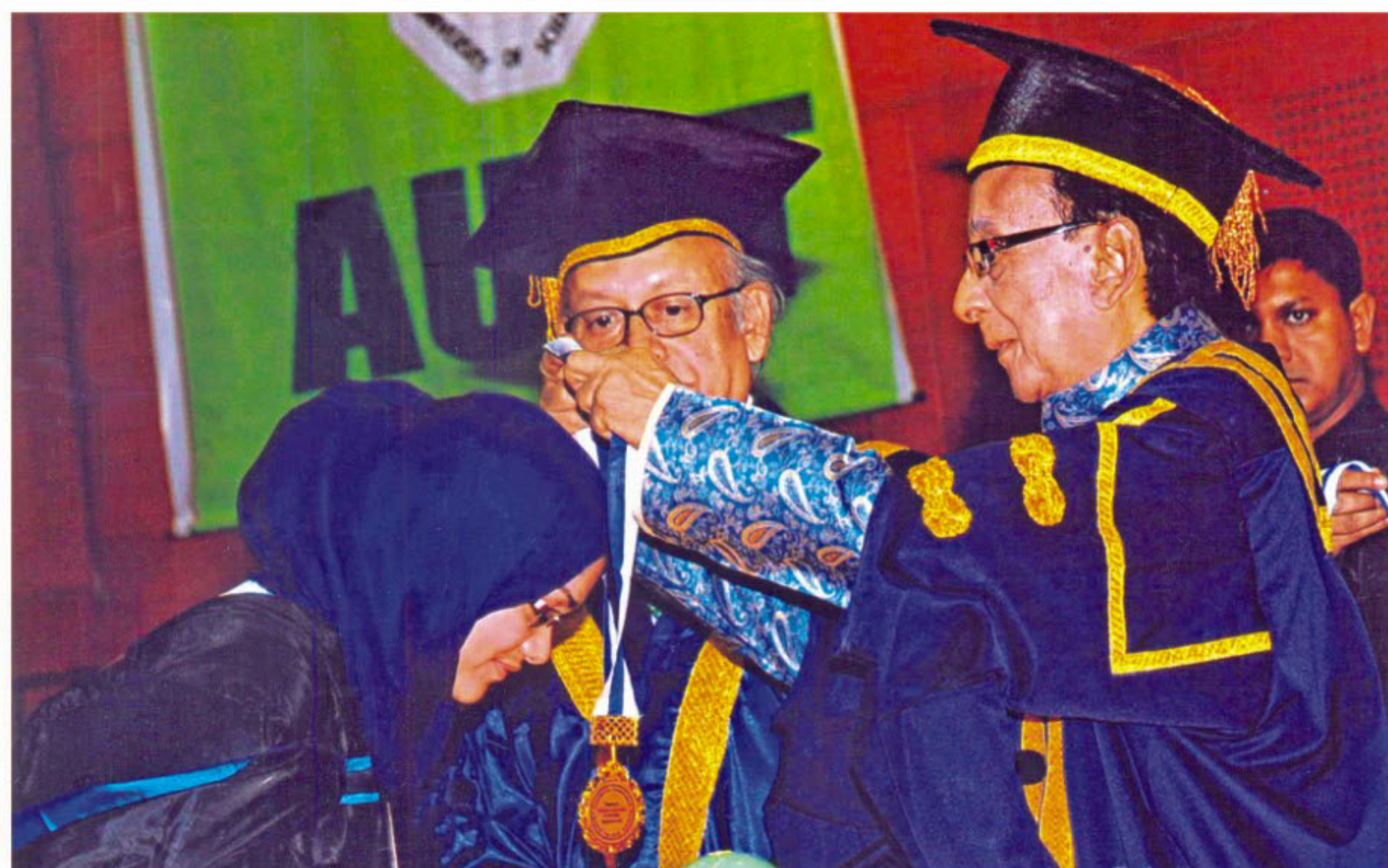
President Zillur Rahman gives away a gold medal to a successful graduate at the 5th convocation of Ahsanullah University of Science and Technology at Bangabandhu International Conference Centre in the city yesterday.

Relatives, friends, colleagues, and well-wishers have been requested to attend the ceremony to pray for the salvation of the departed soul.