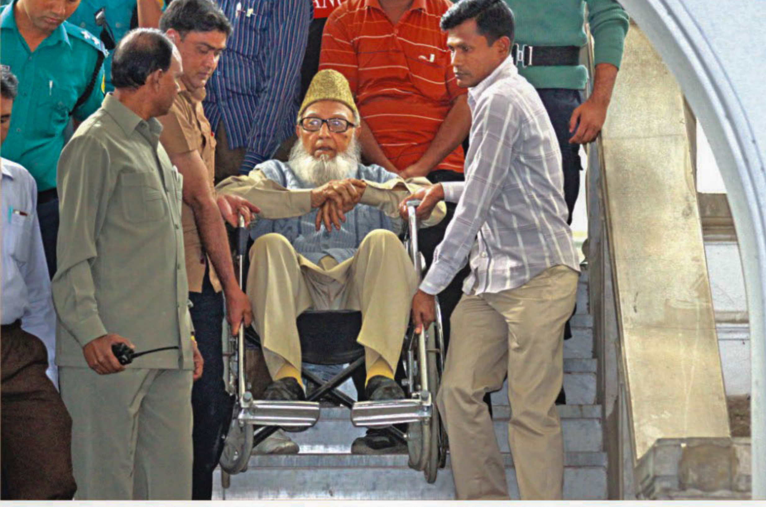
Former Jamaat ameer Ghulam Azam being taken back to his prison cell in BSMMU from the International Crimes Tribunal during the court's lunch break yesterday.

We need a bridge over the Padma river and the government is going to build it soon. This statement or something to this effect has been circulating since the time of the Ershad regime which ended in 1990. Since then all other governments also talked of the bridge, which finally everyone thought is going to be materialised this time. But now a question mark hangs over the bridge again. What is more curious is the way things unfolded. Since the current government came to power, the bridge concept moved quite fast. Multilateral and bilateral agencies started showing concrete interest in the project. And finally funds were firming up. From there everything fell apart. And various curious statements were made and actions taken, many of which raised serious concerns. Construction of the bridge was supposed to start sometime SEE PAGE 19 COL 5