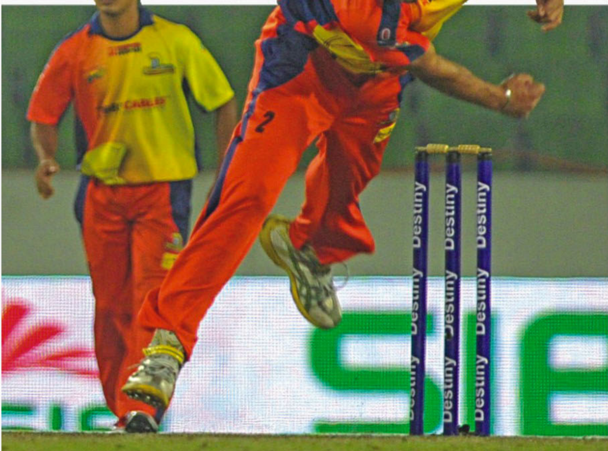
Dhaka Gladiators captain Mashrafe Bin Mortaza bowls during the BPL T20 match against Barisal Burners at the Sher-e-Bangla National Stadium yesterday.