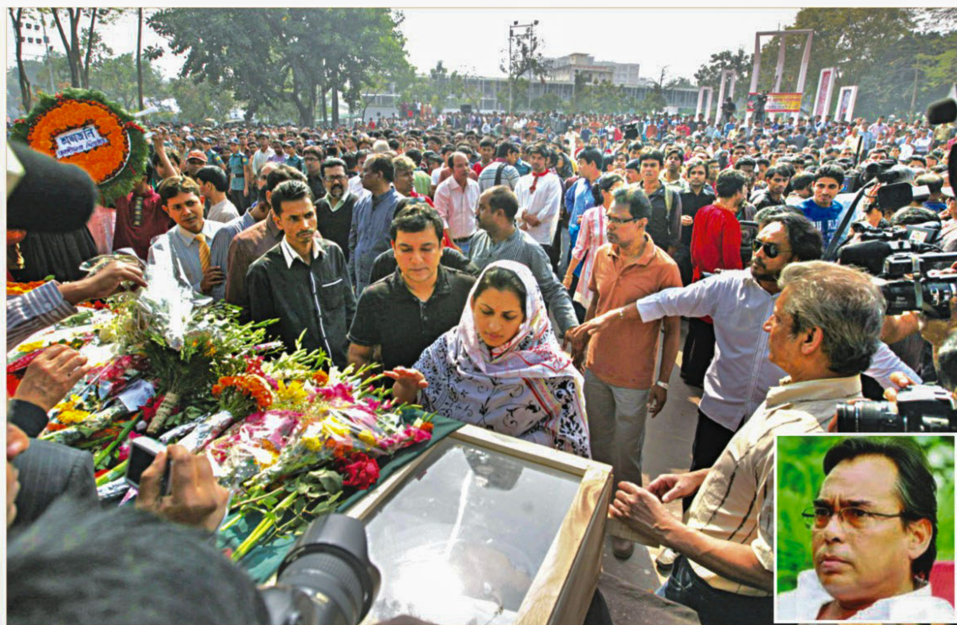
People from all walks of life, including cultural personalities, pay their last homage to the legendary actor Humayun Faridee, inset, placing flowers on his coffin at Central Shaheed Minar in the city yesterday.

Police arrested four people at the time. Two cases were filed on November 8, 2010 in this connection.