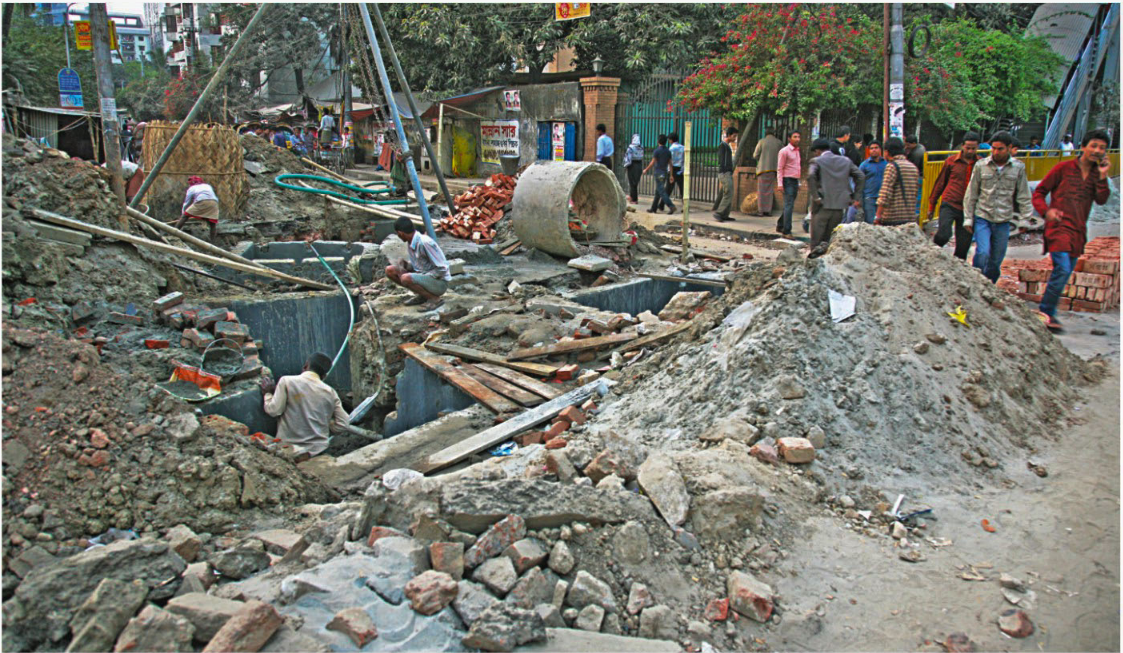
More than one month has passed without any significant progress in the sewer installation work going on at a snail's pace on Kazi Nazrul Islam Avenue near Paribagh foot-bridge in the city, causing utter suffering to commuters. The photo was taken yesterday.

A high-level Japanese mission on space industry will arrive here today on a three-day visit to expand co-operation between Japan and Bangladesh in the field of space technology and industry. The Japan is sending the mission commemorating the 40th anniversary of establishment of diplomatic relations between the two countries. The 30-member delegation includes government officials as well as representatives of agencies and Japanese companies involved in space industry, said Japan embassy sources. The mission will hold "Japan-Bangladesh Space Sector Workshop" here on February 16. State Minister for Science and ICT Yeafesh Osman will attend the workshop as chief guest. Concerned government officials from Bangladesh Space Research and Remote Sensing Organisation (SPARRSO), the food and disaster management ministry, the water resources ministry, the agriculture ministry, Bangladesh meteorological department, Survey of Bangladesh as well as academics and business persons will attend the workshop.