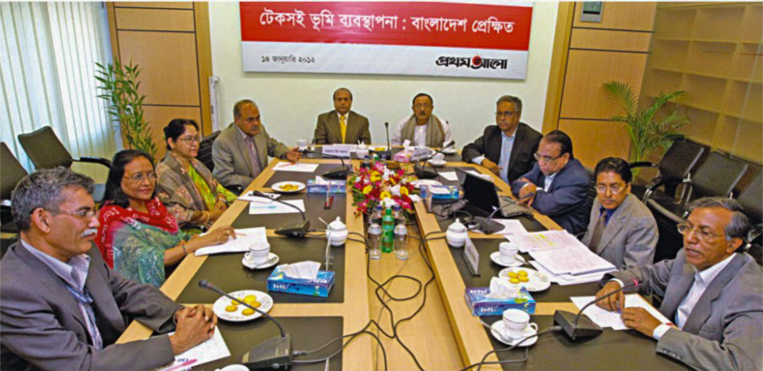
Participants at a roundtable on sustainable land management organised by the daily Prothom Alo at its office in the city yesterday.