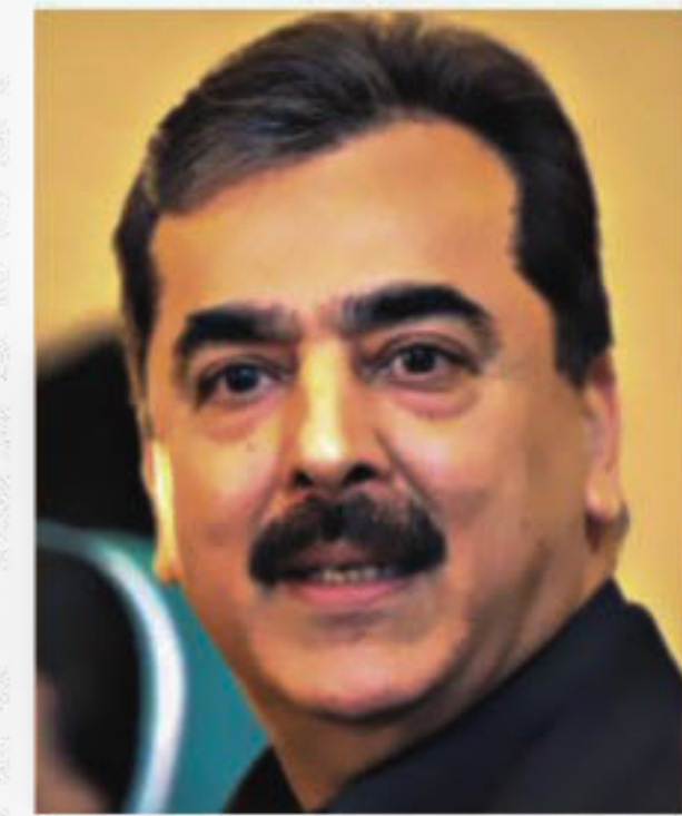
Yousuf Raza Gilani