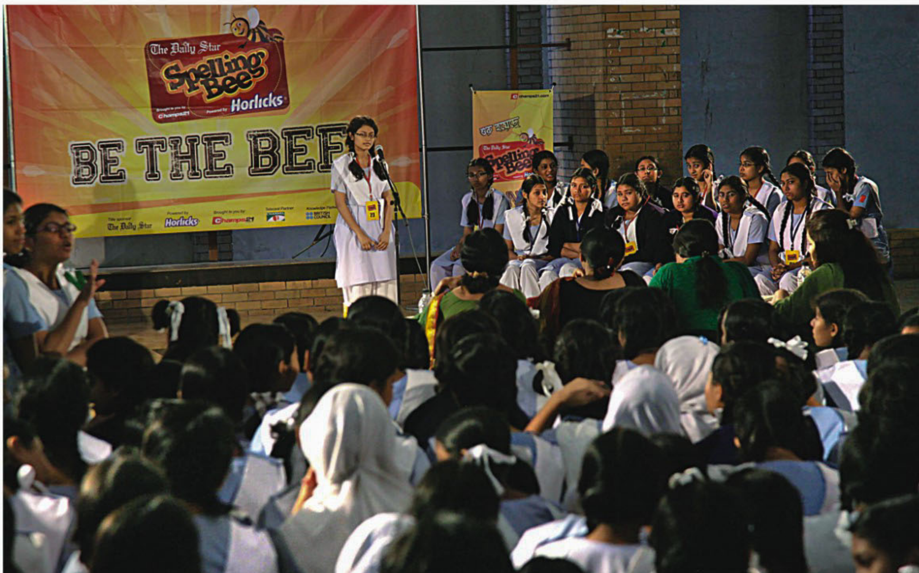
Viqarunnisa Noon School students take part in the Spelling Bee contest yesterday.