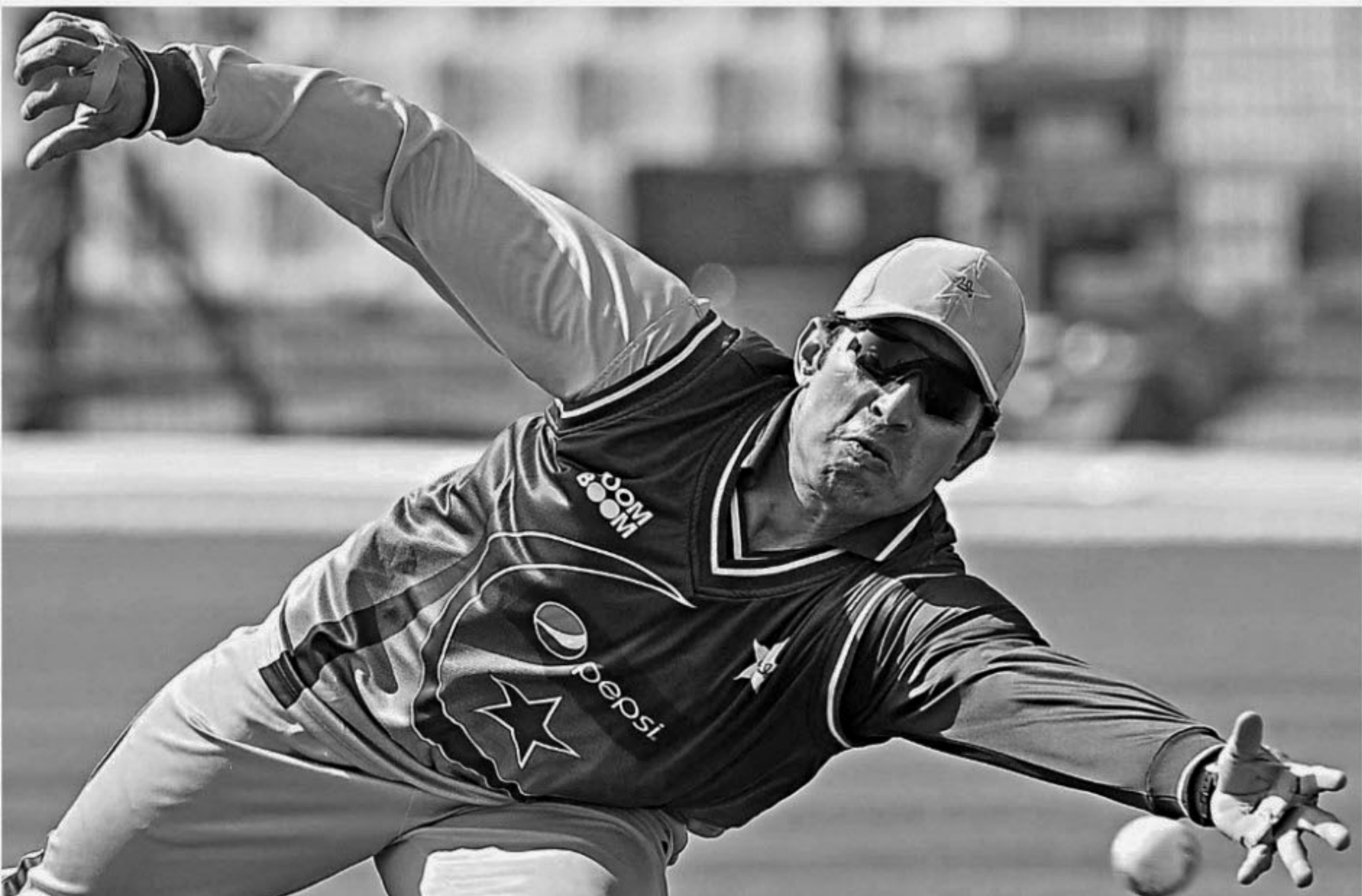
Pakistan captain Misbahul Haq dives to catch a ball during practice at the Sheikh Zayed Stadium in Abu Dhabi yesterday, ahead of the first ODI against England here today.