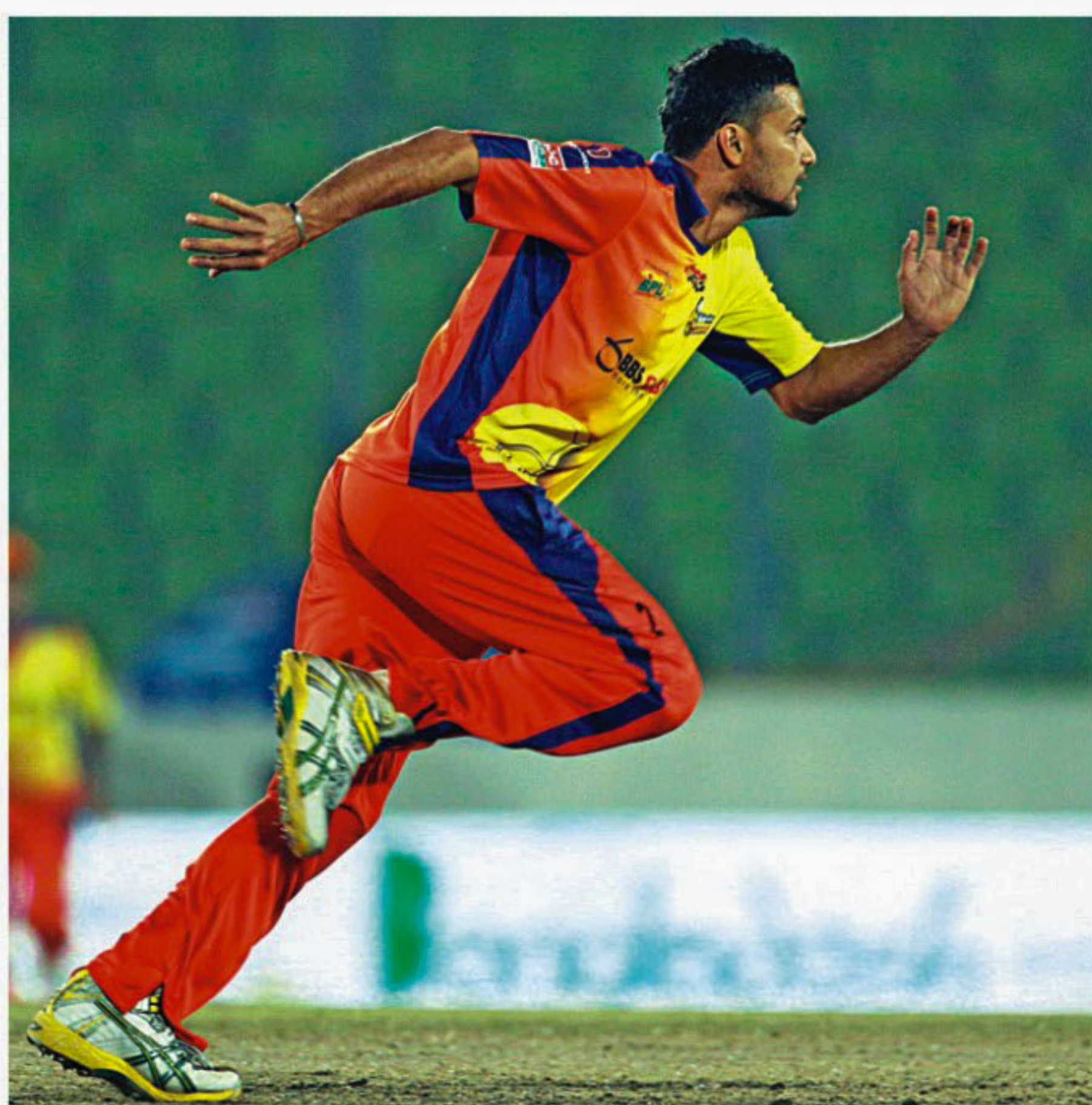
Dhaka Gladiators skipper Mashrafe Bin Mortaza sprints off to celebrate one of his two scalps against Sylhet Royals in their BPL T20 match at the Sher-e-Bangla National Stadium in Mirpur yesterday.