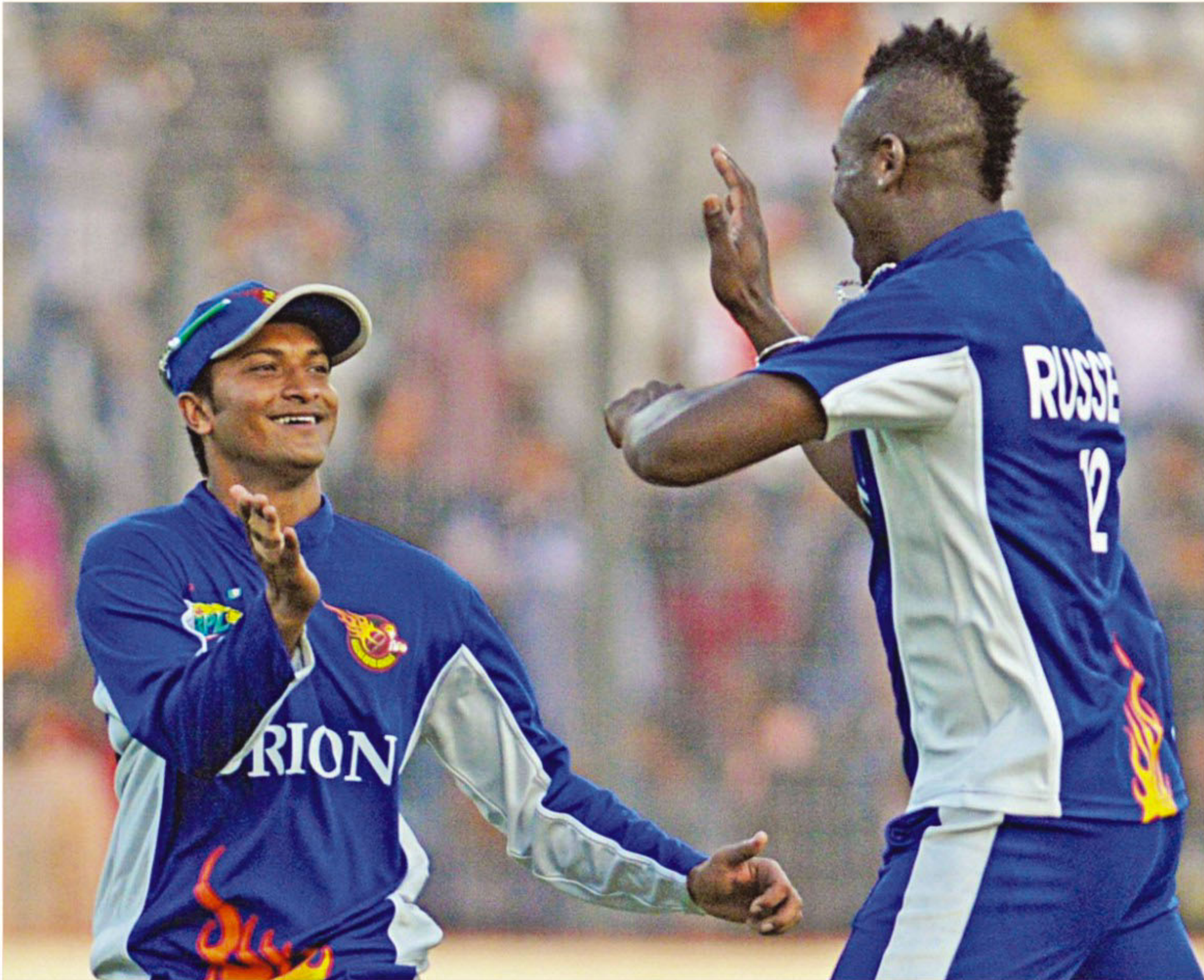
Khulna Royal Bengals captain Shakib Al Hasan celebrates one of four Andre Russell (R) wickets in their 19-run win over Dhaka Gladiators in the Bangladesh Premier League at the Sher-e-Bangla National Stadium yesterday.