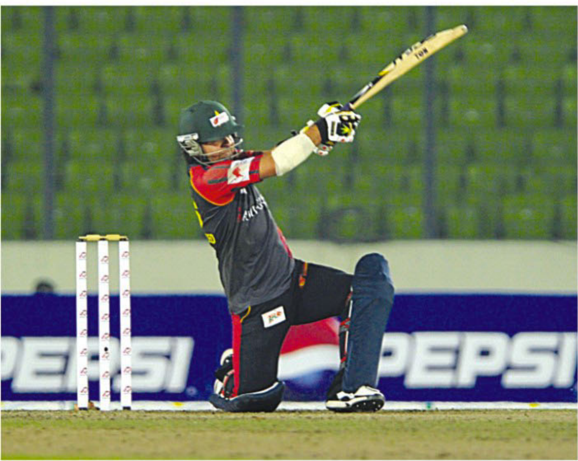
Barisal Burners opener Ahmed Shehzad smacks one through mid-wicket during his 67 against Durgam Rajshahi in the Bangladesh Premier League at the Sher-e-Bangla National Stadium yesterday.