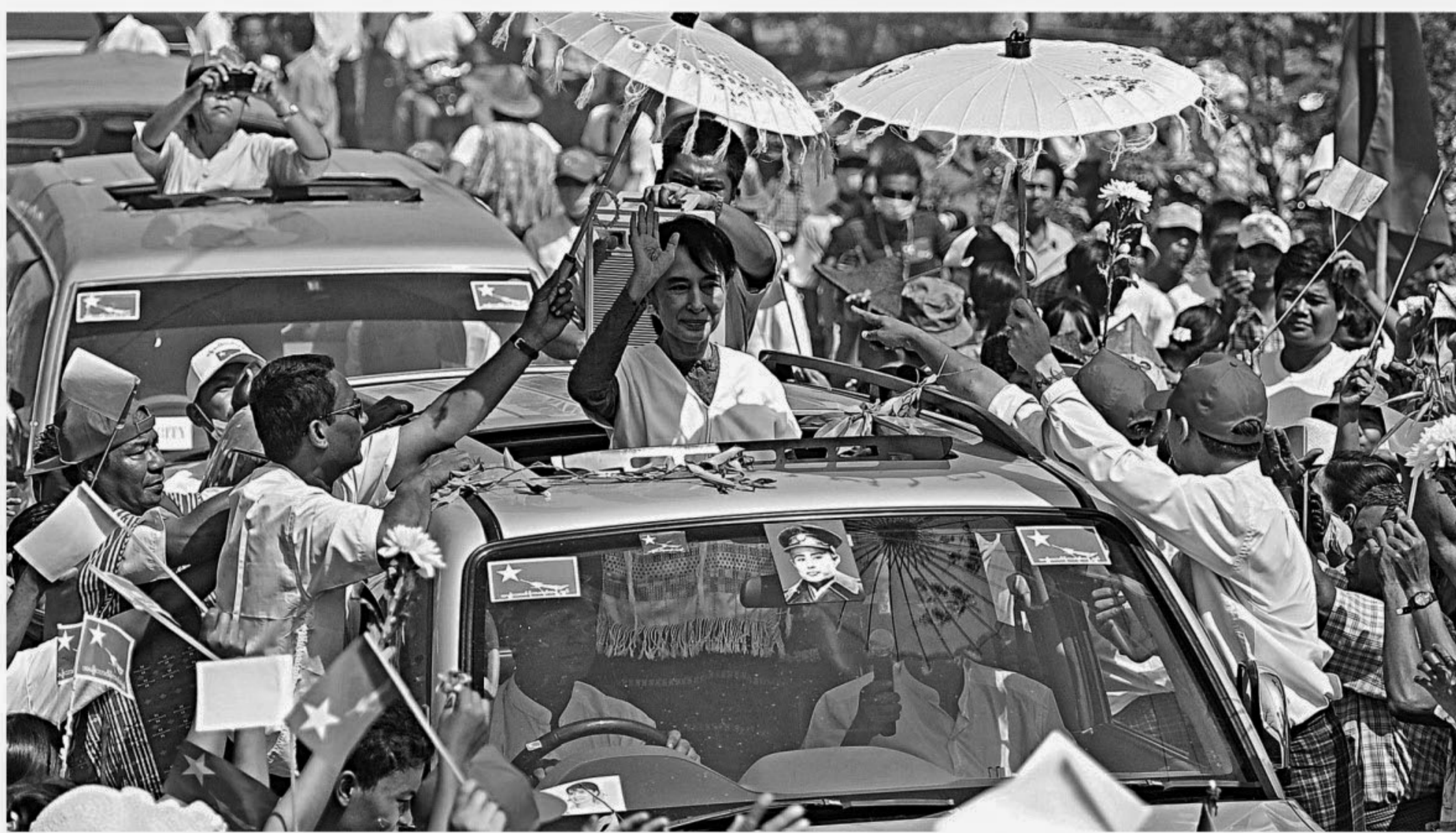
Myanmar opposition leader Aung San Suu Kyi is greeted by supporters yesterday as she travels in a convoy to Wahtheinkha village in Kawhmu township outside Yangon where she will contest a seat in parliament in the April 1 by-election. Suu Kyi was greeted by cheering crowds who gathered to have a glimpse of her.

The call for strikes and protests has divided the country's political forces, with the Muslim Brotherhood -- the big winner in recent parliamentary elections -- coming out against it.