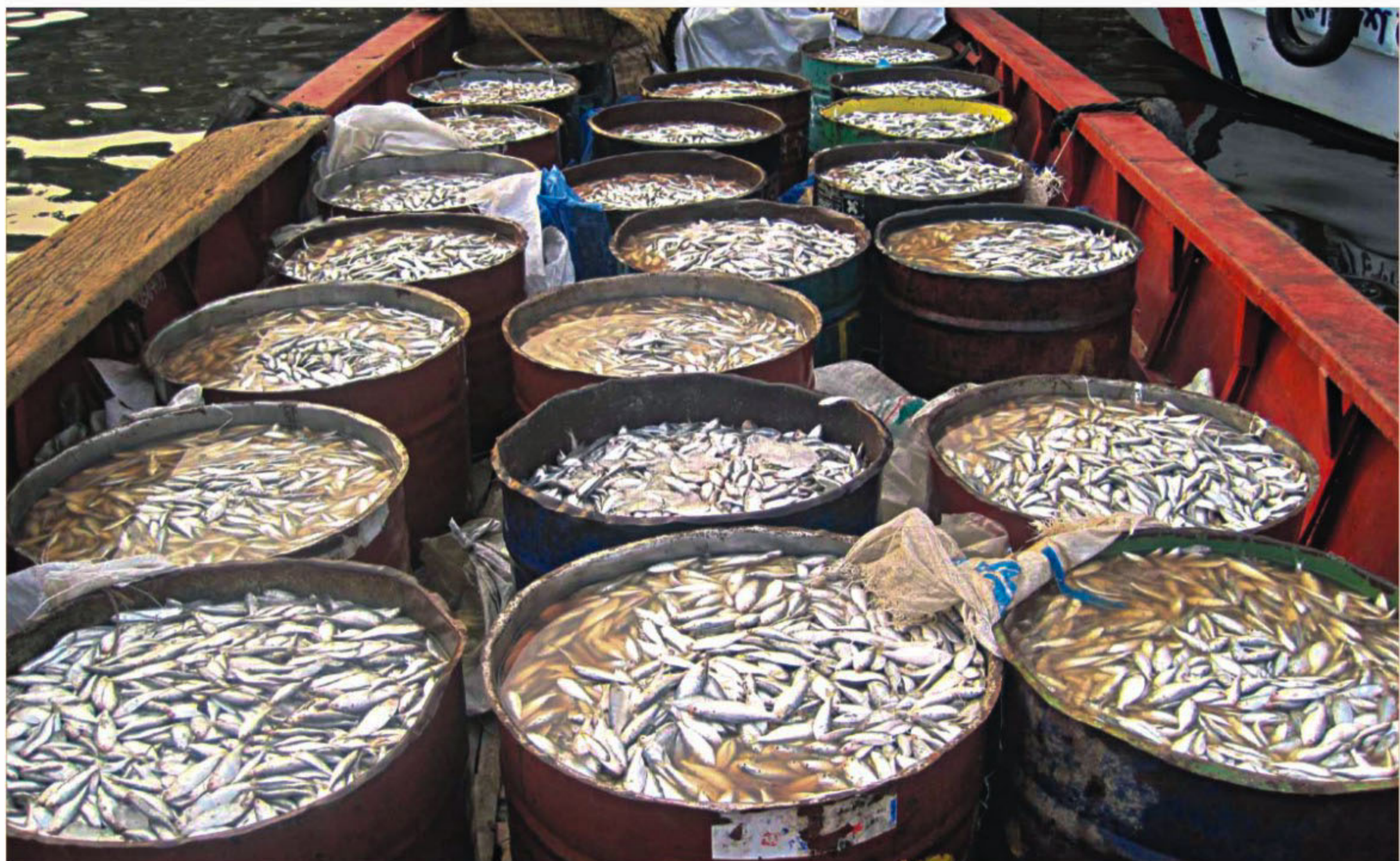
A huge quantity of jatka (hilsa fry) seized from a Dhaka-bound launch on the river Dhaleshwari in Munshiganj yesterday. Story on page 8