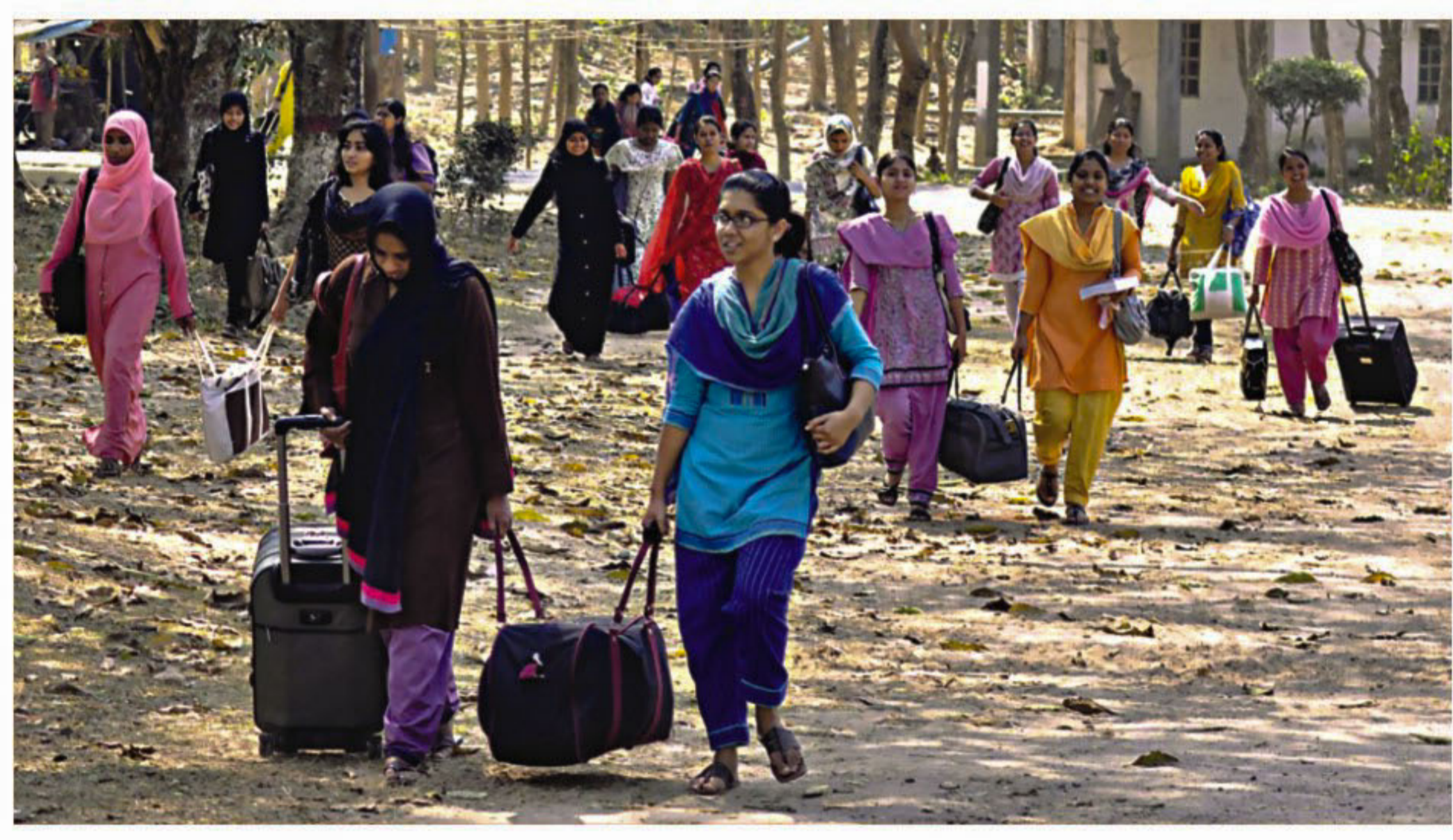
Students are leaving Chittagong University campus as authorities closed the university and ordered them to vacate the dormitories by yesterday morning following Wednesday's violent clashes.

STAFF CORRESPONDENT, Ctg Islami Chhatra Shibir activists vandalised at least 10 vehicles during its half-day hartal in Chittagong yesterday. Shibir, a pro-Jamaat-e-Islami student body, enforced the shut down protesting the deaths of two of its members in clashes with pro-Awami League student body Bangladesh Chhatra League on Chittagong University campus on Wednesday. Police picked up at least eight pickets from different parts of the port