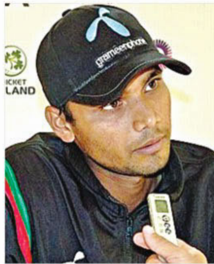
I will stick with it. Please, I don't want to talk about this anymore." The pace bowler has also threat-

When contacted, Mashrafe said: "I don't want to talk about it again. I have told the team management and I am sure they will take the right steps in this regard. From what I've heard, the newspapers have reported it correctly. I haven't seen them but it was said that a player from Biman made the offer.